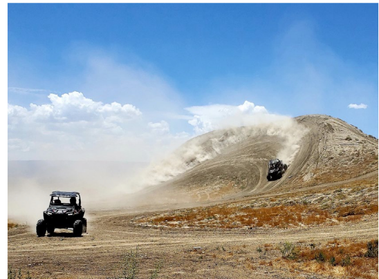
OHV enthusiasts enjoying their public lands

GJF's SRP program issued 32 new/renewing permits and managed 105 permits totaling 12,740 SRP user days. Funds were also utilized to support 50+ active partnerships that provide resource monitoring, education programs, and trash dump clean-ups. Highlights include facility development planning for the Grand Valley OHV area located on 27 1/4 Road.