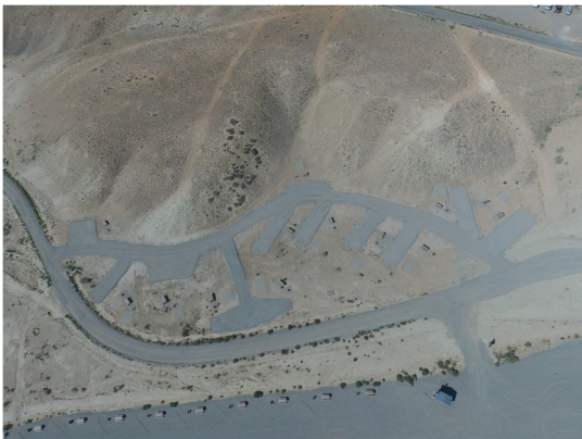
Campers enjoy the sunset after a day of biking

GJFO completed the Event Area and Camping Expansion within the North Fruita Desert SRMA, a popular and nationally recognized mountain bike trail system. A new access road, 3-acre graveled staging area, 53 additional campsites with picnic table and fire ring, four CXT vault toilets, and enhanced trail access were completed. The continued development of camping and event areas enhances our commitment to the local community's interests in sustainable and economically viable outdoor recreation.