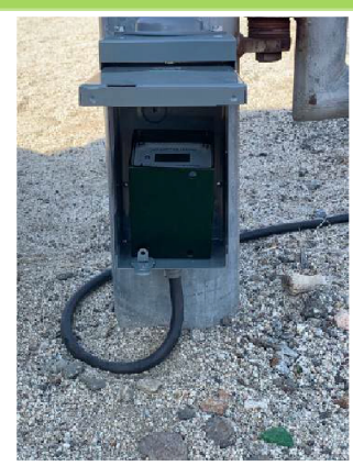
Pneumatic vehicle counter and housing

Recreation Fee dollars were used to purchase a new pneumatic counter and associated equipment to track visitation to the visitor center. It replaced an older counter that had been utilized. Still, it was vandalized, and replacement parts were no longer available from the manufacturer.