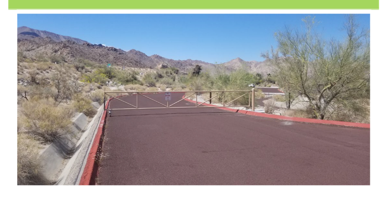
Gate installed at the visitor center

Recreation Fee dollars were used to purchase a gate for the visitor center to improve the Randall Henderson Trail access. The gate will provide safe access to the trail from the visitor center parking lot 24/7 while securing the visitor center and other facilities. The gate was installed in FY22.