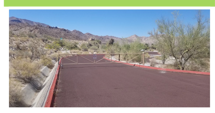
visitor center gate installed