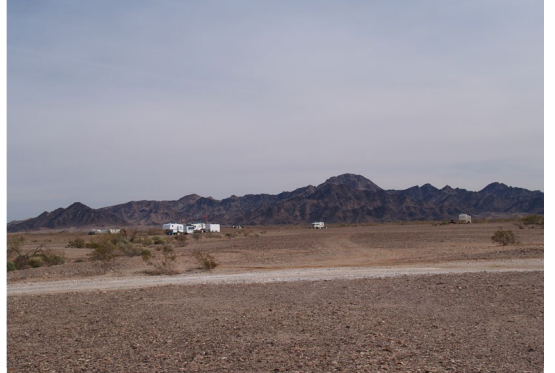
Mule Mountain Long Term Visitor Area