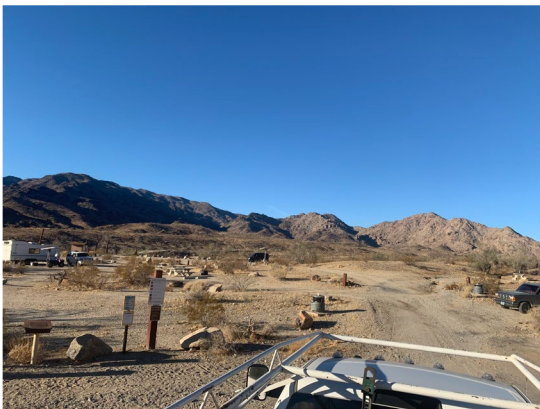
Corn Springs Campground

Recreation Fee dollars were utilized to maintain, manage, and patrol four developed campgrounds. Three campgrounds have onsite volunteer campground hosts, water systems, vault toilets, and dump stations.