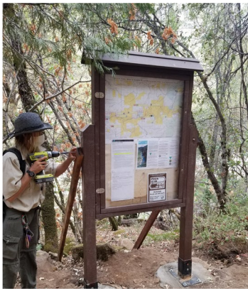
Installation of Purdon Crossing Kiosk

In 2021 $36,000 of FLREA revenue was spent on improving visitor signage and improving the water system at the S. Yuba campground within the S. Yuba SRMA. The campground's aging water system had developed a significant leak found and repaired. The fix noticeably reduced water use. The staff updated signage along the S. Yuba National Trail to highlight supplemental rules to mitigate adverse impacts to other visitors, private property owners, and the public lands.