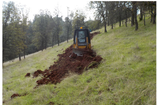
First Cut Sky Ridge Trail

Cronan Ranch offers stunning views of the snow-covered peaked mountains of the Sierra Nevada and the Coloma Valley, where gold was discovered. A high ridge had no sustainable trail from the top to existing trails between Magnolia Ranch to Cronan Ranch. This new trail links these parcels and will stop user trails to the top. This new trail, named the Sky Ridge Trail, is now a regular destination for many people, rewarded with a bench to rest on and enjoy the view from the top.