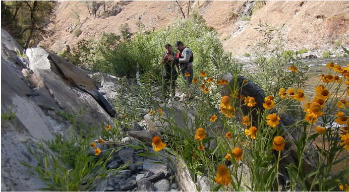
Monitoring W&S Tuolumne River