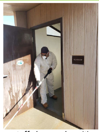
Maintenance staff clean and sanitize restrooms.

Sixty-three vault toilets in the Imperial Sand Dunes Recreation Area (ISDRA) were maintained to accommodate the high visitation in the ISDRA. Daily duties include graffiti removal, cleaning, painting, trash collection, and toilet paper restocking. This year, 14 solar lights were installed to enhance the visitor experience; and new signs, doors, windows, and locks were installed.