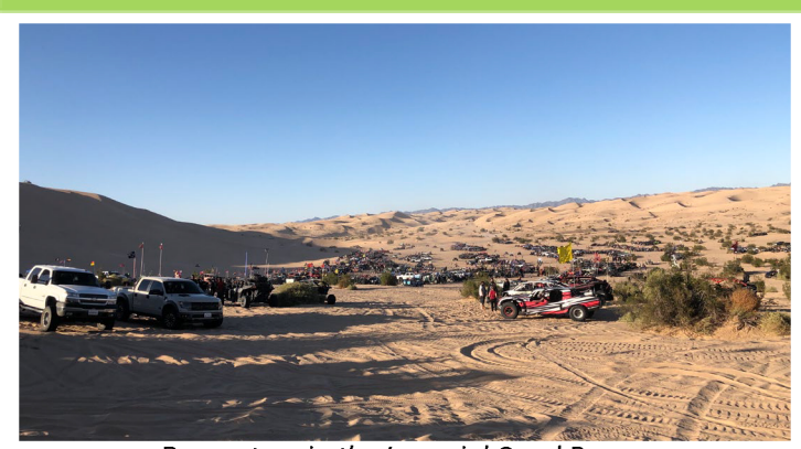
Recreators in the Imperial Sand Dunes