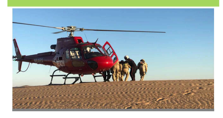
EMS staff transport a patient to a helicopter.

The BLM El Centro Field Office provides an off-highway vehicle (OHV) emergency medical and rescue services in the Imperial Sand Dunes. During the 2020-2021 use season, park rangers responded to 448 calls, including 62 search and rescues. These park rangers are trained to search for and evacuate injured or lost riders and may use special OHV rescue capabilities such as vehicle extrication to complete the mission.