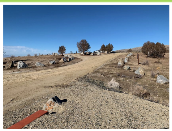
Local Trail Maintenance

The BLM Eagle Lake Field Office utilized Recreation Fee Dollars collected from off-highway vehicle (OHV) Special Recreation Permitted (SRP) motorcycle race events held at the Fort Sage OHV Area. Work with Fee Dollars in FY21 included utilizing rental equipment, volunteers, local business, and BLM staff to accomplish approximately 8 miles of trail maintenance to lessen erosion and place large boulders to ensure OHV users stay in the trailhead and off of burned areas.