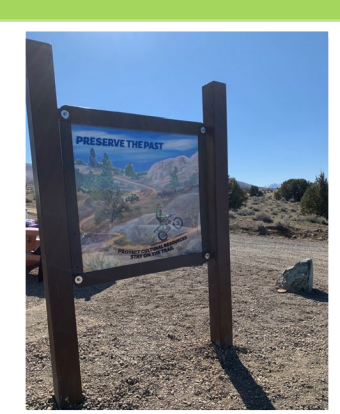
Information Kiosk Within Eagle Lake Field Office

The BLM Eagle Lake Field Office plans to utilize Recreation Fee Dollars collected from off-highway vehicle (OHV) Special Recreation Permitted (SRP) events held at the Fort Sage OHV Area to rent equipment for volunteers, local businesses, and BLM staff to accomplish approximately 5-15 miles of trail maintenance to lessen erosion. In addition, BLM plans to utilize the funding to pump the vault toilets and supplies for routine maintenance. BLM will also recruit hosts and pay their stipend in areas fees are collected and continue to upgrade facilities in need at those sites.