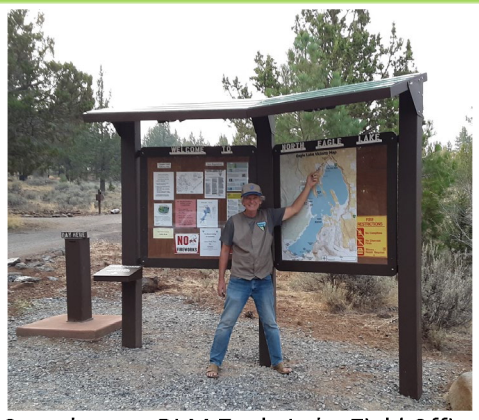
Camphost at BLM Eagle Lake Field Office

The BLM Eagle Lake Field Office obtained hosts at the North Eagle Lake Campground and the Hobo Camp Day Use Area. The hosts assisted with facility cleaning, graffiti removal and conducted multiple public contacts at the North Eagle Lake and Rocky Point Campgrounds as well as along the Bizz Johnson National Trail. Funding from Fee Dollars collected onsite and from events was utilized to pay the volunteer campground host stipend and purchase a new kiosk and fee box.