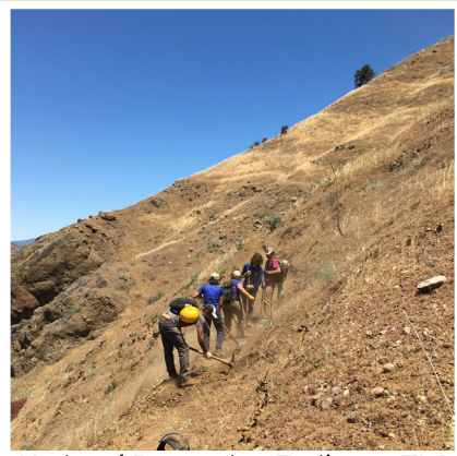
National Recreation Trail gets TLC

BLM Central Coast Field office used revenue funds for Park Rangers to patrol and maintain recreation areas across Monterey, San Benito, and Fresno counties. ParkRangers collect fees, monitor campgrounds, provide outreach to visitors, and maintain the recreation sites. Our Recreation Park Rangers also team up with partners such as Americorps to do much-needed trail repairs and daily site maintenance.