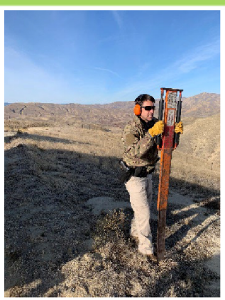
Tumey Hills Clean-up and Route Maintenance

BLM Central Coast Field Office used the revenue to fund Park Rangers and lead volunteers to perform clean-up of left-over target shooter trash. Repairing fences, replacing signage, and graffiti removal are performed by Park Rangers at the San Joaquin Valley recreation sites as well.