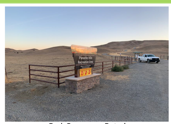
Park Ranger on Patrol

In 2022, the Central Coast Field Office plans to use fee revenues to support ongoing monitoring, patrols, and maintenance of 6 campgrounds and seven-day use sites.