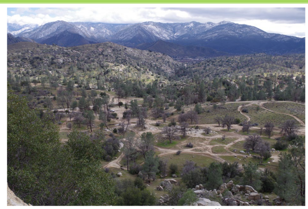
Scenic View of Keysville

Keysville is a historic mining area that offers various recreational opportunities. A little exploration can turn up many historic resources, including multiple mining structures and features, a historic fort, and the famous Walker Cabin. Keysville offers commercial and non-commercial rafting opportunities and fishing, recreational gold panning, and dispersed camping. A network of trails provides for mountain biking, equestrian, and motorized recreation use.