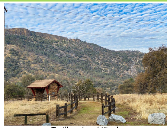
Trailhead and Kiosk

The scenic San Joaquin River Gorge Special Recreation Management Area straddles the San Joaquin River. With over 20 miles of outstanding multi-use trails that weave their way through the management area, a route is awaiting your next adventure. There is river Access Day-Use, and a Visitor Center with extensive opportunities for educational experiences for visitors, schools, and other groups. Multiple campgrounds and day-use sites are available for your enjoyment.