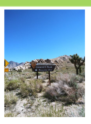
Old Sign of Chimney Peak Recreation Area