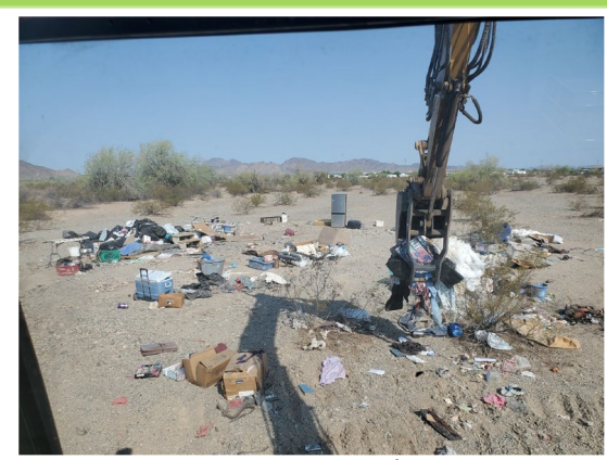
Heavy Equipment Cleanup

Recreation funds ($15,000) were utilized to clean up abandoned campsites and property (vehicles and household items included) within the La Posa Long Term Visitor Areas (LTVAs) near Quartzsite, Arizona.