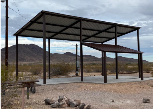
Host site improvements