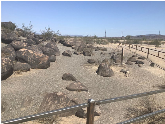
Metal barrier installed around petroglyphs

Recreation fee expenditures were used to install a rail fence around the Painted Rock Petroglyph Site. This site is considered significant to many tribes in southern Arizona. The fence allows visitors to view and appreciate the archaeological site while protecting it from damage. Approximate cost was $25,000.