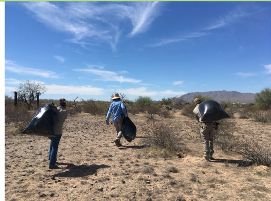
BLM staff removing bags of smuggling trash

Recreation fee expenditures assisted in purchasing supplies and providing Law Enforcement services for a multi-day cleanup event. The June 2021 event resulted in the removal of 10,440 lbs. of drug and immigrant smuggling trash. Repeated cleanups are organized to provide for the health and safety and visitor enjoyment on the Sonoran Desert National Monument. Approximate cost was $10,000.