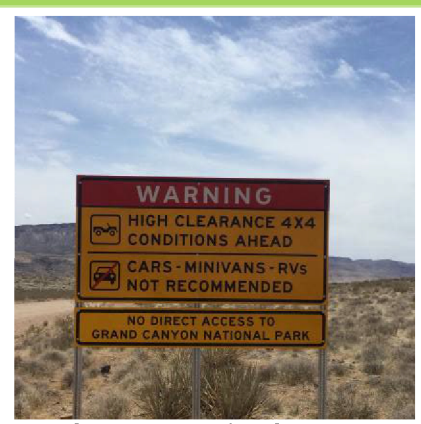
Information and Safety Signs

The BLM installed two 4x8-foot visitor safety signs along a high-traffic main entry road to the monument. The signs note that the road does not provide direct Grand Canyon National Park access. The signs also provide visitor safety recommendations. Expended amount: $1,023