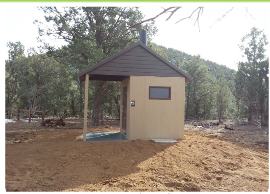
New Vault Toilets

Recreation fee revenue from the Arizona Strip Field Office will purchase and install new accessible vault toilets at Tassi Ranch, the Grand Gulch Mine, and the Nampaweap trailhead in 2022. These are three of the monument's most visited cultural history public use sites. The purpose is to enhance the visitor's recreation experience and protect resources in areas where Special Recreation Permit holders operate. Projected cost: $76,106.42