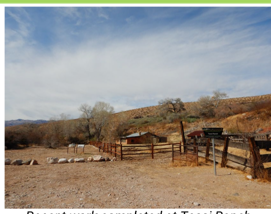
Recent work completed at Tassi Ranch

A new site sign and split rail fence were installed at Tassi Ranch. Grass and other vegetation were trimmed, and hazardous trees were removed to ensure visitor safety and protect the ranch's historic structures. The buildings at Tassi Ranch are some of the best examples of early 20th-century historic structures on the monument. Expended amount: $1,731