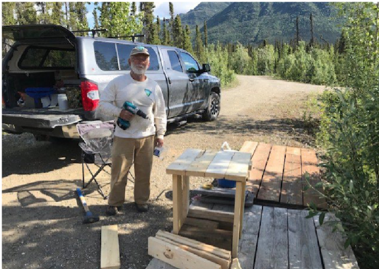
Volunteer working at Marion Creek Campground