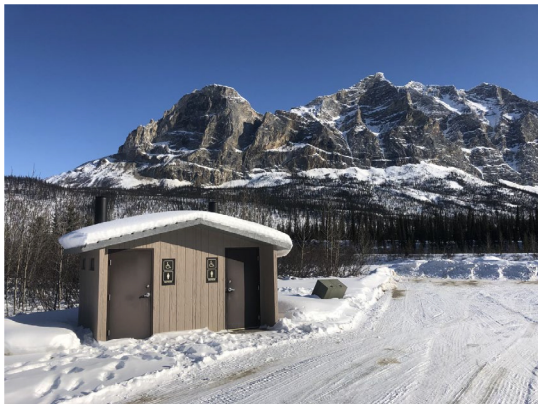
Sukakpak Mtn wayside, 210 miles from Fairbanks

The Central Yukon Field Office (CYFO) administers lands along 250 miles of the Dalton Highway. The Dalton traverses the Alaska arctic and sub-arctic, where few services and facilities exist. The CYFO maintains 32 vault toilets at campgrounds and waysides along the highway and one holding tank at the Arctic Interagency Visitor Center. In 2021, a contractor was hired ($28,000) to service the 33 holding tanks and haul the waste for disposal to the nearest approved treatment facilities, hundreds of miles distant.