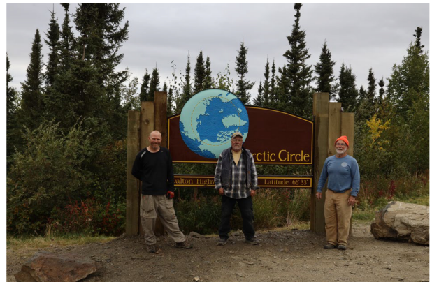
Staff and volunteers showcase a newly placed sign

During the summer of 2021, the CYFO supported 6 volunteers who provided visitor experience enhancements through public outreach, interpretive services, and maintenance assistance at waysides and campgrounds along the Dalton Highway. The volunteers staffed the Marion Creek Campground, Yukon River Contact Station and Arctic Interagency Visitor Center. Using recreation fees, volunteers were reimbursed $13,507.95 for meals and other incidental expenses incurred while living in a remote wilderness setting.