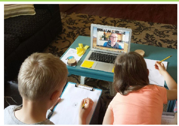
Students study nature virtually with CCSC Educator

Campbell Creek Science Center (CCSC) provided 203 virtual programs, reaching 4,718 people (2,545 youth and 2,006 adults) in fiscal year (FY) 2021. Participants attended from 36 Alaska communities, 46 communities in 22 states of the United States, and 3 international countries. Topics covered the diversity of BLM's multiple use and sustained yield mission. Programs included Alaska Explorer for K-6th grade at home learners, Fireside Chats, naturalist talks, and Nature Journaling. This is a milestone achievement in virtual learning, a new field for BLM.