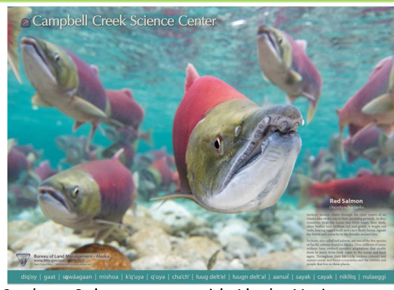
Sockeye Salmon poster with Alaska Native names

Self-guided experiences engaged learners in the outdoor world with nature-based activities. CCSC developed 23 Nature Learning Resources; 7 Agents of Discovery missions; 2 webpages; 1 sockeye salmon lifecycle poster, which included Alaska Native name translations; 1 plant pollinator interpretive panel; 1 Campbell Tract Quest; 1 immersive multi-module asynchronous learning platform on Alaska's Watersheds and Watershed Science; 4 pop-up walks; and created 43 unique distance learning lesson plans.