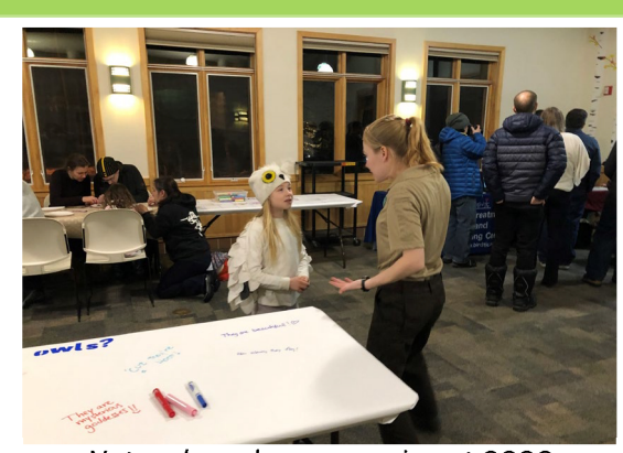
Nature-based programming at CCSC

CCSC plans to publish its Federal Lands Recreation Enhancement Act Business Plan in FY2022. The site will implement the new plan and utilize prior-year recreation fees as the facility reopens. These recreation fees include operational labor of education technicians who will provide a diversity of enhanced amenity interpretive programs such as hikes, talks, distance learning, evening programs, and workshops. CCSC selected priority projects from program needs identified through management and public involvement, focusing on visitor engagement, interpretation, and education. CCSC will incorporate recreation.gov for fee collection in FY2022.