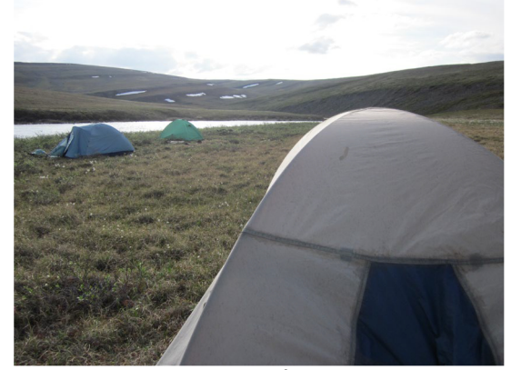
Camp site in the NPR-A

The Arctic District Office (RDO) issues authorizations to permitted guides for Special Recreation Permits (SRPs) that offer hunting opportunities to small groups for species such as caribou, moose, and grizzly bear. Often these groups will operate out of spike camps for the length of their guided hunt, which is typically a week or less.