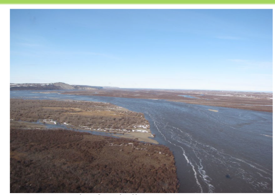
Bank of Colville River at Umiat

RDO would like to install a covered area for boaters to use when taking out on BLM-managed land along the Colville River at Umiat, which would directly benefit recreation users in the area.