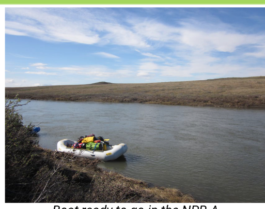
Boat ready to go in the NPR-A

Hunting isn't the only reason people visit lands managed by RDO. The RDO also processes SRP authorizations for guided rafting, hiking, and wildlife viewing tours. These trips often require overnight camping at multiple locations along the route, typically for no more than two nights at each spot.