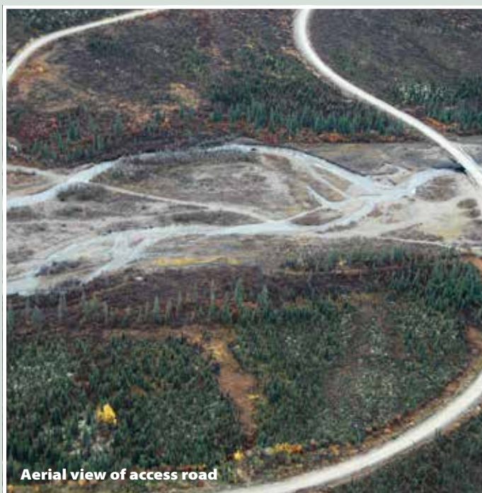
Aerial view of access road