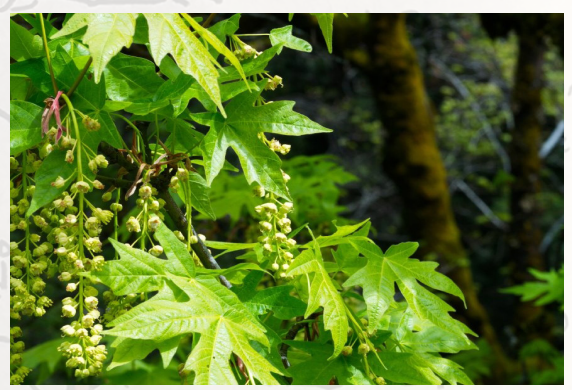
Big leaf maple, Acer macrophyllum

Little Creek is a riparian area, which is a plant community growing next to a river or stream. You will notice trees include big leaf maple and California bay laurel.