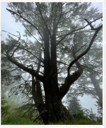
Douglas-fir Pseudotsuga menziesii

Douglas fir seeds provide food for small mammals, including chipmunks, mice, shrews, and Douglas squirrels. Many songbirds eat the seeds right out of the cone, and raptors, including northern spotted owls, rely on old-