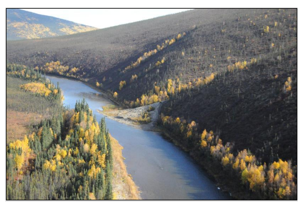
Figure 9. Helicopter flyover photograph of coarse debris alluvial fan, Birch Creek Wild and Scenic River, September 08, 2021. View is downstream. Stressors periodically contributing to Birch Creek turbidity levels include debris slides, active and abandoned placer-mined areas as well as soil instability and erosion associated with wildfires and melting permafrost.