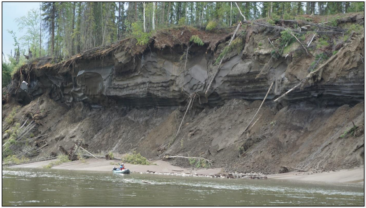
Figure 10. Steese NCA seasonal ranger paddles up for a closer look at the exposed ice lens on Birch Creek Wild and Scenic River. July 2020.