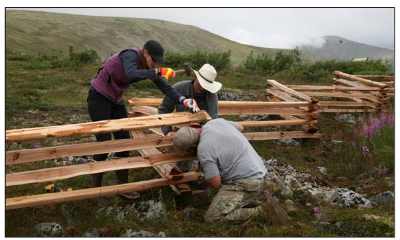
Figure 12. Three volunteers building a fence in the vicinity of Pinnell Mountain National Recreation Trail.