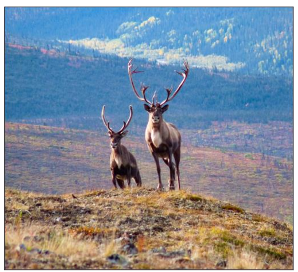
Figure 2. Two caribou standing on a hill in alpine tundra with fall colors in the background.