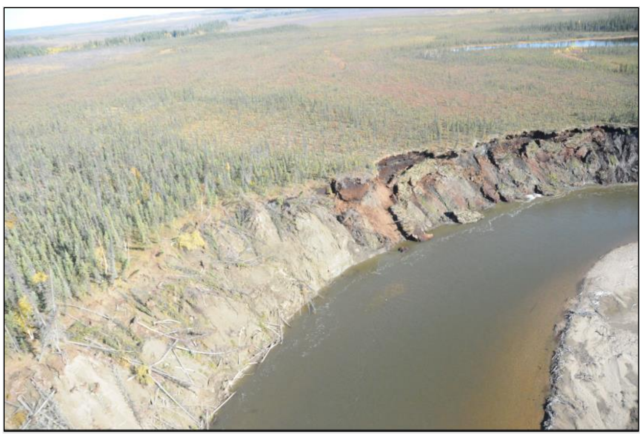
Figure 7. Helicopter flyover photograph of lower Birch Creek Wild and Scenic River showing accelerated erosion of permafrost bank, lower Birch Creek Wild and Scenic River corridor, September 09, 2021. View is upstream.

Increased surface erosion associated with thawing permafrost and melting ground ice results in thermokarst development in low gradient areas and increased thermal erosion on hill slopes. Detachments of seasonally thawed permafrost hill-slope areas and accelerated erosion of ice-rich river embankments are evident in the lower reaches of Birch Creek WSR. Figures 7 through 11.