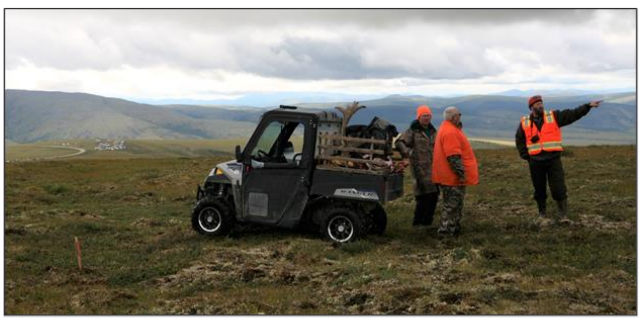
Figure 3. Public outreach along the Pinnell Mountain National Recreation Trail during hunting season. August 2021.

This year, the NCA successfully administered GPRA surveys to evaluate visitor satisfaction and comply with the Act. The results showed that 86% of visitors were satisfied with the NCA. Many who were dissatisfied, commented on OHV impacts and suggested more law enforcement was needed during hunts to improve the site.