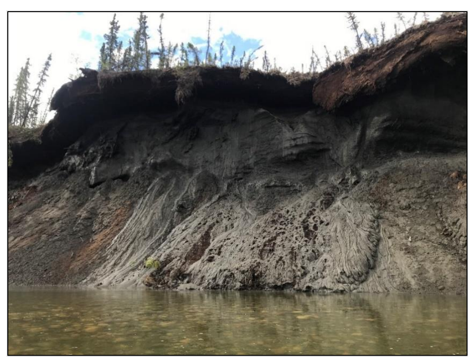
Figure 8. Streamside photograph showing unstable embankment, melting permafrost area, lower Birch Creek Wild and Scenic River.