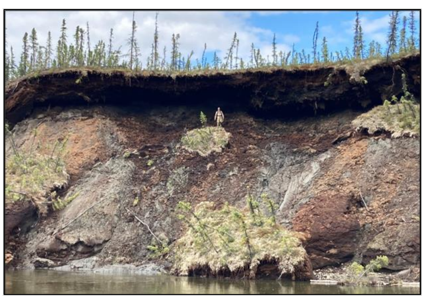
Figure 5. Close up view of stream bank sloughing into the river.