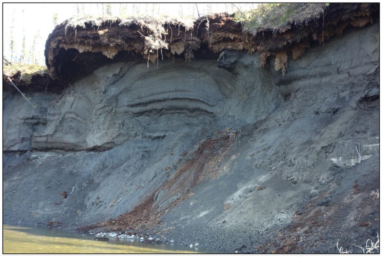
Figure 11. Streamside photograph showing unstable embankment, melting permafrost area, lower Birch Creek Wild and Scenic River, June 2020.