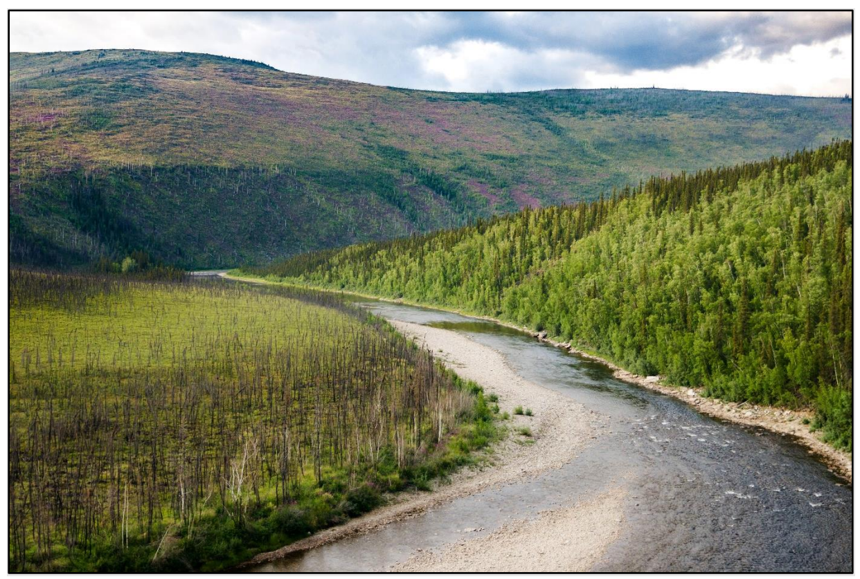
Figure 1. Scenic view of a bend in Birch Creek Wild and Scenic River.

The EIFO completed the draft Steese TTMP in July of 2021 and has received public and agency comment. EIFO is currently working to address those comments and expects to publish the final TTMP in FY2022.