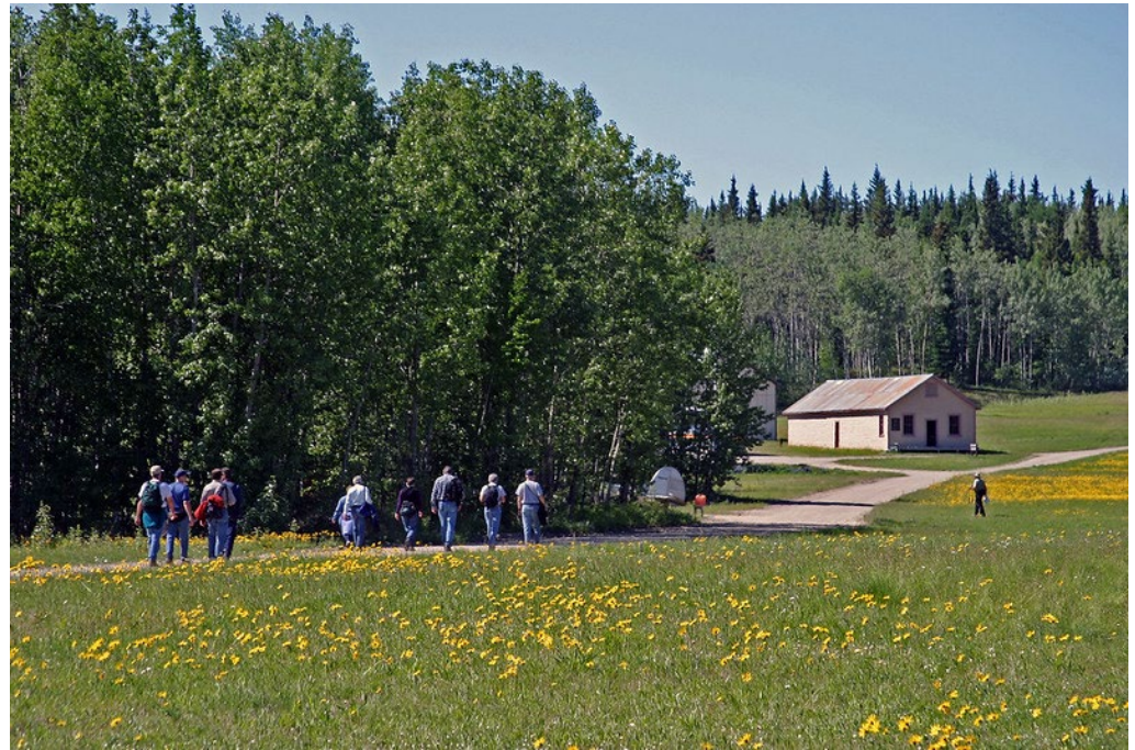
Fort Egbert National Historic Site