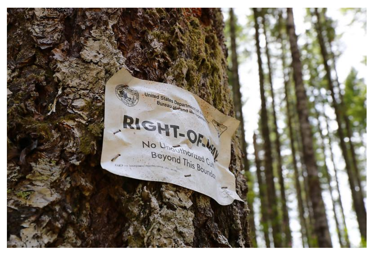
Photo of BLM Right-of-Way sign on the Rowell Creek Timber Sale, BLM NW Oregon District.