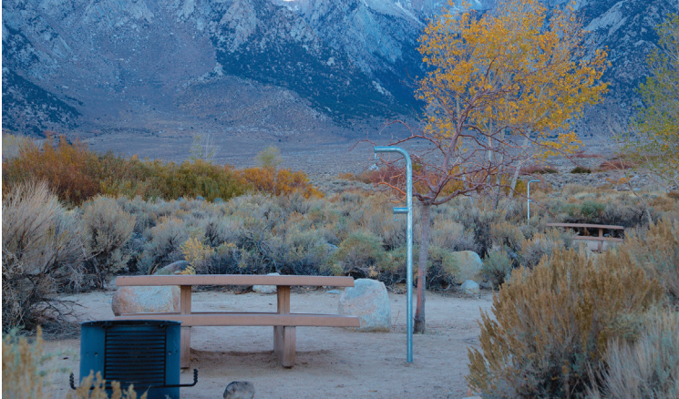
Tent site at Tuttle Creek Campground near sunset