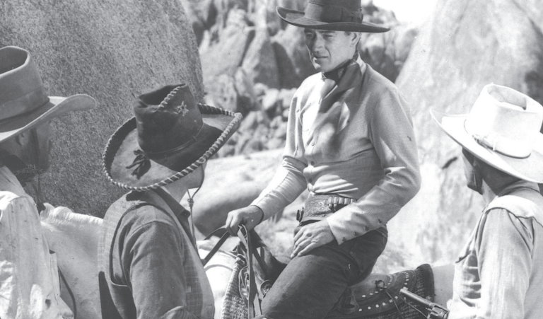
Photo from The Lawless Range courtesy of Beverly and Jim Rogers Museum of Western Film History