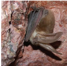
Townsend's big-eared bat