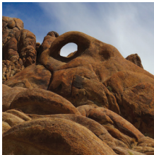
Eye of the Alabama