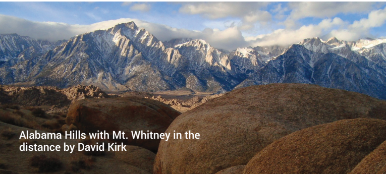
Alabama Hills with Mt. Whitney in the distance