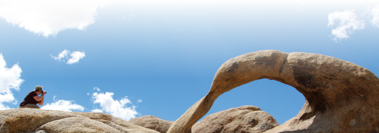
Photographer capturing Mobius Arch by Jim Pickering, Cover photo of photographers by Bob Wick

Camping is also available at the Inyo County Portuguese Joe Campground just to the east of the Alabama Hills and the Forest Service Lone Pine Campground Lone Pine Campground on the Whitney Portal Road. Camping in campgrounds helps maintain the area's great scenery and recreational opportunities. City of Los Angeles Department of Water and Power lands in the area are open for day use only.