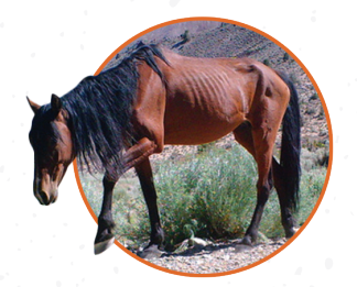
Starvation and thirst for horses, burros and other wildlife

Overpopulated herds threaten land and herd health. Too many wild horses and burros can lead to: