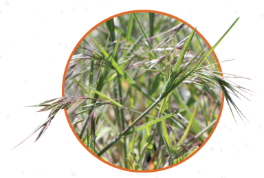
Less native vegetation and more invasive weeds, such as cheatgrass