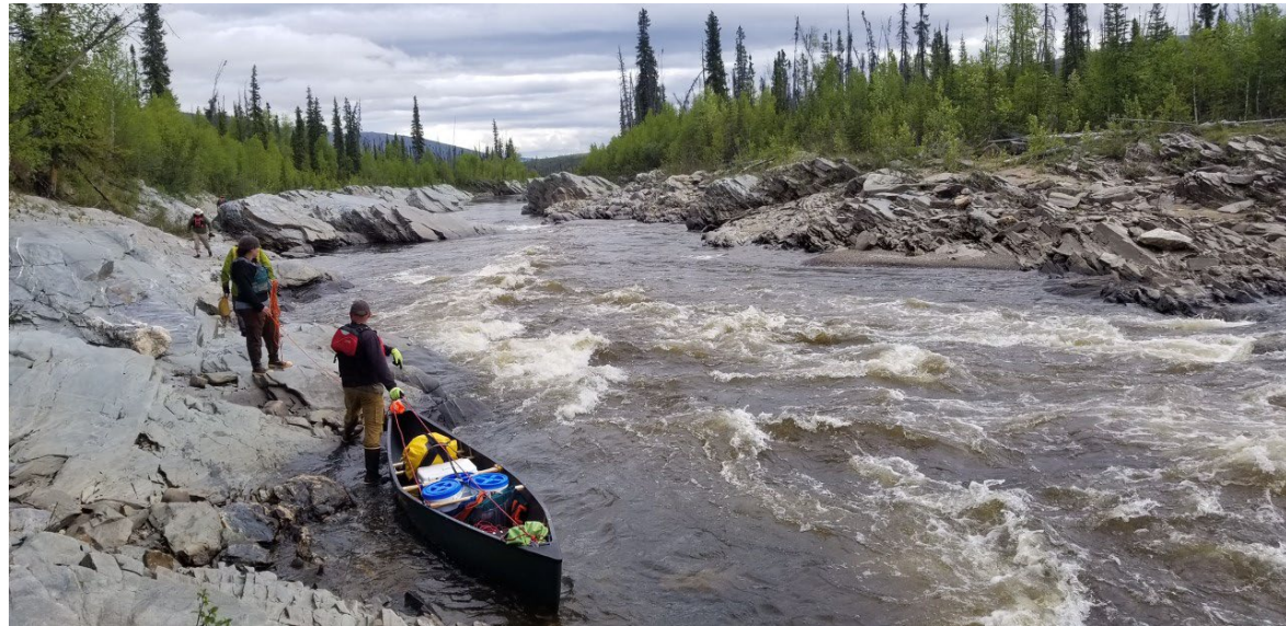
Birch Creek WSR in Steese NCA