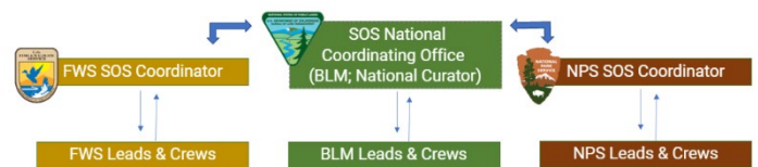
Figure 2. Interagency Coordination

Regular communication between all parties involved in SOS collections is an essential part of the SOS program. The BLM hosts the National Coordinating Office, which manages overall program data, infrastructure, training, and policies. Each agency manages their own SOS teams and have a designated coordinator who (Figure 2). Any questions, collection logistics, training inquiries, or other needs should be communicated to a team's agency coordinator. Agency coordinators (Appendix I) will be in communication with each other throughout the season to make sure everyone has the information and support they need to be successful.