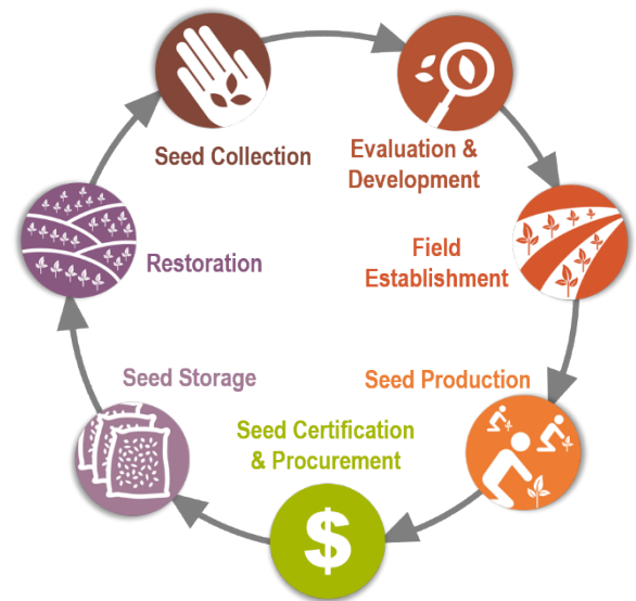
Figure 1. The Native Plant Materials Development Process

Estimates have shown that between 10 and 20 collections of a single species (depends on species), across its range, are needed to develop genetically appropriate ecotypes; thus, this is a collection goal for each species collected by SOS. Processing and storage partnerships have been formed to achieve the program's goal of native plant materials development so that SOS collectors can make collections throughout the range of targeted species.