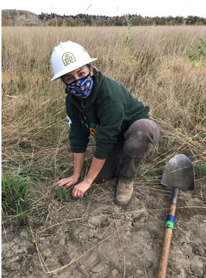
MCC crew planted and protected 144 trees (Plum, Buffaloberry, Chokecherry, Golden Currant and Rocky Mountain Juniper) and 96 grasses (Basin Wildrye, and Blue bunch Wheatgrass) on the ACEC as part of Montana’s Upland Game Bird Enhancement Program.

We continue working with Montana Fish Wildlife and Parks, Pheasants Forever, and Habitat Forever partners to improve wildlife habitat and hunting opportunities for the public within the ACEC at PPNM. This year the Billings Field Office developed a 4-year Vegetation Management Plan for Pompeys Pillar ACEC (2020–2023). The following vision statement was developed: “Provide safe opportunities for current and future visitors to the BLM land around Pompey’s Pillar for hunting and hiking, while protecting the natural visual characteristics and native flora and fauna along the Lewis and Clark National Historical Trail corridor and around Pompey’s Pillar.”