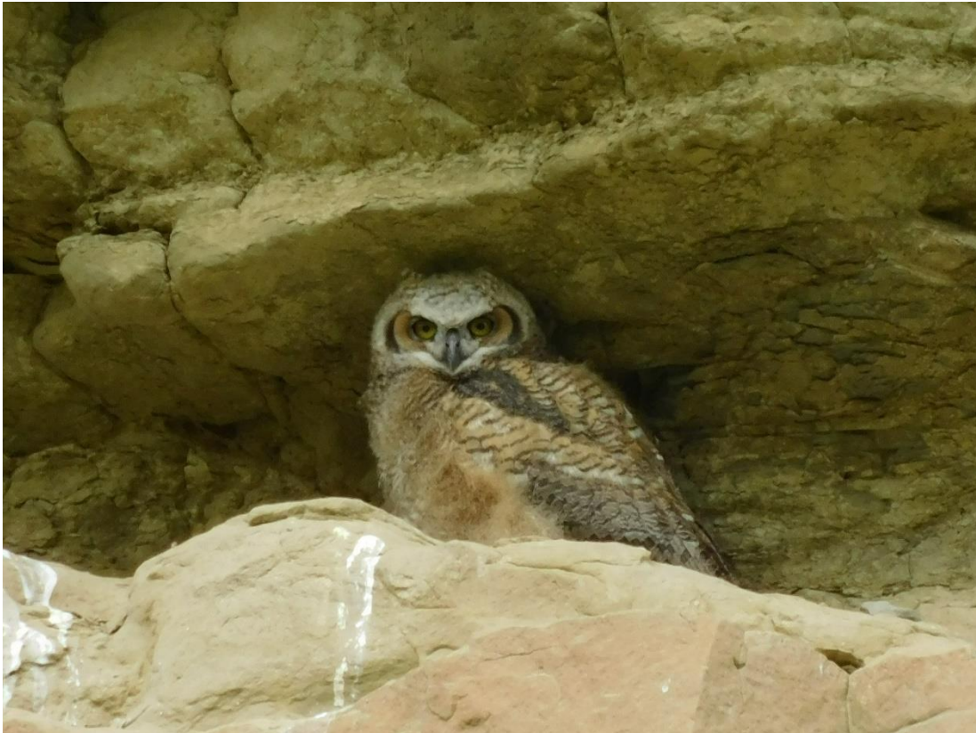
A resident of the Pillar, Great Horned Owl