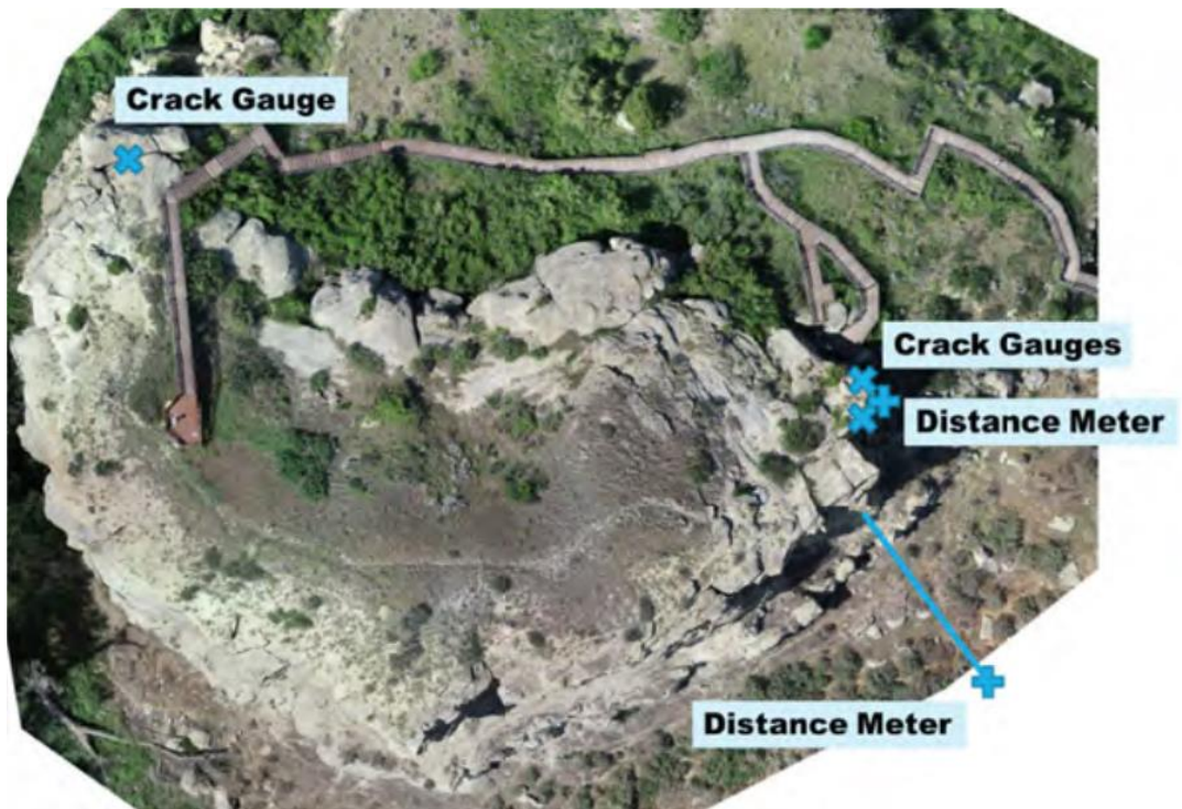
Location of Monitoring devices at Pompeys Pillar