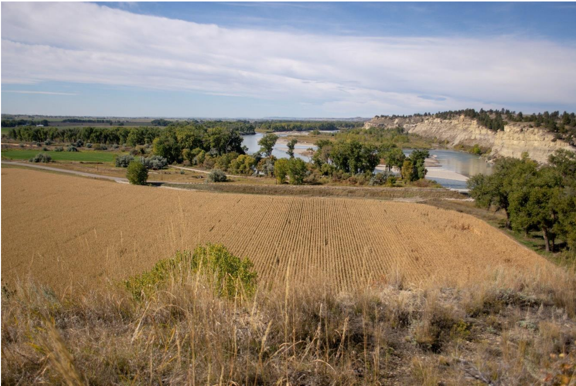
Looking west atop Pompeys Pillar with the Yellowstone River in view