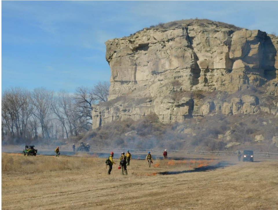
Prescribed Fire at Pompeys Pillar National Monument