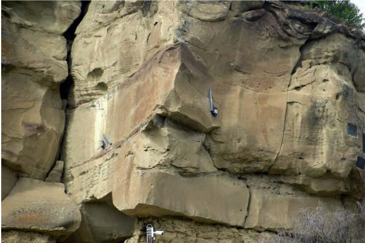
Crack meters installed on rock at Pompeys Pillar