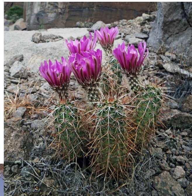
NATIONAL SYSTEM OF PUBLIC LANDS U.S., DEPARTMENT OF THE INTERIOR BUREAU OF LAND MANAGEMENT