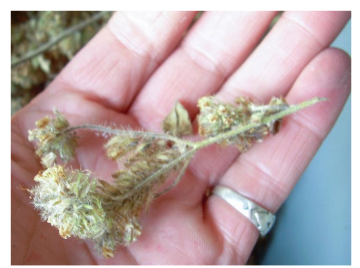
Figure 12. Clipped silverleaf phacelia seed head.

Collection methods. Seed can be collected by hand stripping or by clipping filled seed heads (Fig. 12) (Luna et al. 2008; Bujak and Dougher 2017). Hands should be protected when collecting silverleaf phacelia seed (Winslow 2002). Bristly hairs on the seed heads contain an irritating oil that can cause rashes and itching that lasts several days (LeFebvre et al. 2017b).