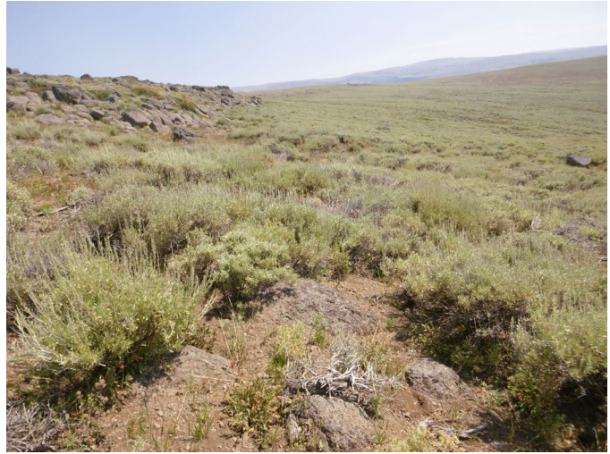
Figure 2. Silverleaf phacelia in a sagebrush community in Oregon.

and support greater vegetation cover (Day and Wright 1985). In the White Mountains of California, silverleaf phacelia occurs in alpine vegetation on south- and east-facing slopes below 13,000 feet (4,000 m) (Mitchell et al. 1966). Dominant shrubs and subshrubs are wax current ( Ribes cereum ), granite prickly phlox (Linanthus pungens), Nuttall's linanthus (Leptosiphon nuttallii), little sagebrush (A. arbuscula), and timberline sagebrush (A. rothrockii). Climate in the White Mountains is cold and semi-arid with an average annual precipitation of 15.5 inches (394 mm) and temperature of 28 °F (-2 °C) (Mitchell et al. 1966). In Clark and Nye counties of Nevada, silverleaf phacelia is associated with sagebrush/pinyon-juniper, big sagebrush-curl-leaf mountain mahogany (Cercocarpus ledifolius), and ponderosa pine (Pinus ponderosa) communities occurring at elevations of 6,000 to 8,500 feet (1,800-2,600 m) (Beatley 1976).