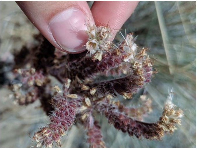
Figure 9. Silverleaf phacelia inflorescence exhibiting indeterminate flowering and seed maturation.

Wildland Seed Collection. Silverleaf phacelia seeds are mature when capsules are dry, and seeds are hard and dark in color. Because flowering is indeterminate (Fig. 9), both mature capsules and flowers or buds may be present at the time of harvest (LeFebvre et al. 2017b). Bristly hairs on the coiled seed head make hand harvesting uncomfortable (Fig. 10) (Winslow 2002).