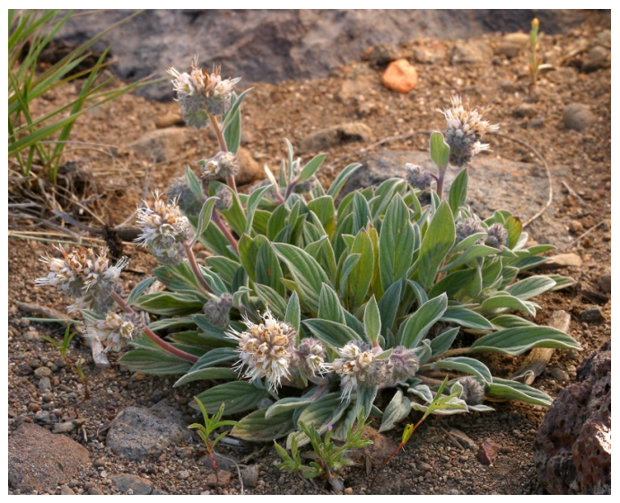
Figure 5. Silverleaf phacelia (variety hastata ) has silvery green foliage. The leaves are lanceolate and petiolate with pointed tips.

Silverleaf phacelia is a short-lived perennial with a stout taproot. Plants have a multi-branched caudex, numerous prostrate to ascending stems, and rarely reach more than 20 inches (50 cm) tall. Stems and leaves are silvery green with fine to stiff, spreading to appressed pubescence, making the hairs almost sticky (Fig. 5) (Munz and Keck 1973; Hickman 1993; Pavek et al. 2012; Welsh et al. 2016; Hitchcock and Cronguist 2018; Luna et al. 2018). Root systems of plants growing on talus slopes in Lassen Volcanic National Park, California, grew upslope from the caudex because soil shifting pushed the aboveground plant material away from the roots. For 10 silverleaf phacelia plants on these slopes, the root/shoot biomass averaged 0.63. Root length averaged 10.8 inches (27.5 cm) and depth averaged 8.6 inches (21.8 cm) (Pérez 2012).