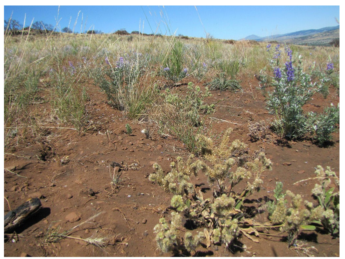
Figure 1. Silverleaf phacelia in a California grassland.

exposures where silverleaf phacelia is much less common (Blinn 1966). In montane grasslands on the east side of Rocky Mountain National Park, Colorado, silverleaf phacelia only occurred in plots not invaded by sweetclover (Melilotus officinalis). Montane grasslands occupy well-drained soils and are dominated by mountain muhly (Muhlenbergia montana), blue grama (Bouteloua gracilis), and needle and thread (Hesperostipa comata subsp. comata) (Wolf et al. 2004). Silverleaf phacelia is abundant in talus and scree communities above tree line (10,249 feet [3,124 m]) on Mt. Washburn in northcentral Yellowstone National Park. Spreading wheatgrass (Elymus scribneri) dominates talus and scree communities, where the frost-free season averages 93 days, and precipitation is less than 32 inches (800 mm)/year (Aho and Bala 2012).