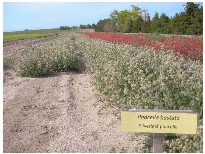
Figure 14. Silverleaf phacelia seed production plots growing at Oregon State University's Malheur Experiment Station in Ontario, OR.

averages ranged from 34.3 to 153 lbs/acre (38.4-171 kg/ha) and increased with irrigation in most years (Shock et al. 2018).