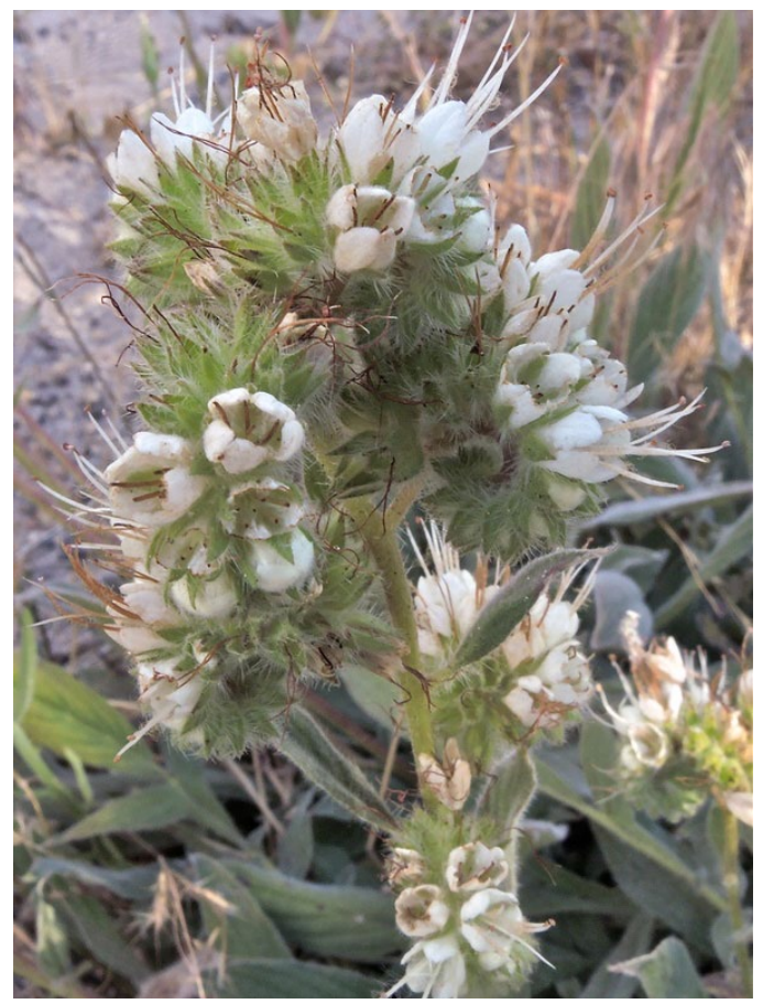
Figure 6. Silverleaf phacelia inflorescence with helicoid cyme of small, crowded, white flowers with long exerted stamens, Oregon State University's Malheur Experiment Station (2018).

Silverleaf phacelia produces many tight- to opencoiled cyme inflorescences (helicoid cymes) with small white to lavender or purple flowers (Fig. 6) (Blackwell 2006; Pavek et al. 2012; Welsh et al. 2016; Hitchcock and Cronguist 2018). Inforescences are terminal and simple to branched with flowers along most of the flowering stalk length (Munz and Keck 1973; Blackwell 2006; Luna et al. 2018). Individual flowers are subsessile with urn to bell-shaped, tubular corollas 4 to 7 mm long with five spreading lobes (Munz and Keck 1973; Hickman 1993; Luna et al. 2018). The five stamens extend beyond the spreading corolla lobes by more than 2 mm. Styles are 7 to 10 mm long and deeply divided (Hickman 1993; Welsh et al. 2016; Luna et al. 2018). Silverleaf phacelia produces dry, stiff, ovoid, 2 to 4 mm long capsules with stiff hairs (Hickman 1993; Welsh et al. 2016; Luna et al. 2018). Capsules are two-chambered and typically contain one to three seeds (Hickman 1993; LeFebvre et al. 2017b). Seeds measure 1.5 to 2.6 mm long, and have pits in vertical rows (Hickman 1993; Welsh et al. 2016).