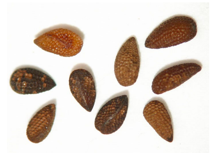
Figure 13. Clean silverleaf phacelia seed.

Seed Cleaning. Small seed size, easily detached flower capsules, and fair seed flow, makes silverleaf phacelia moderately easy to clean (Winslow 2002). Seed is typically cleaned (Fig. 13) by processing it through a hammermill and then a fanning mill (Link 1993; Luna et al. 2008), but more detailed procedures are provided below.