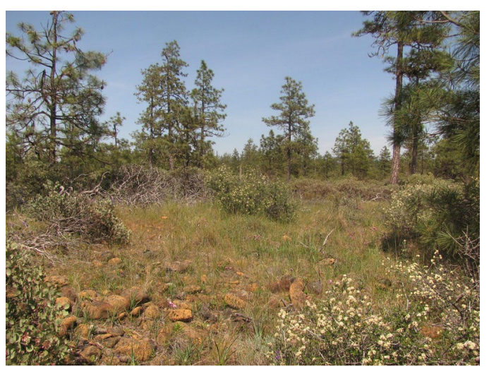
Figure 3. Silverleaf phacelia conifer habitat in Oregon.

Woodlands/Forests. Silverleaf phacelia can be found in a variety of montane woodland and forest types. It grows in western juniper (J. occidentalis) woodlands in the Steens Mountain of southeastern Oregon dominated by 80-yearold trees and 24% overstory canopy cover (Bates et al. 2000). In central Oregon's pumice region, silverleaf phacelia is associated with ponderosa pine forests (Busse et al. 2009). Silverleaf phacelia occassionally occurs in exceptionally well-drained, shrub-free pumice sand flats in Jeffrey pine (P. jeffreyi) forests on Glass Mountain, Mono County, California (Horner 2001). In the South Warner Mountains in southeastern California, silverleaf phacelia grows in several forest types found on western and northwestern slopes including white fir/sweetcicely (Abies concolor/Osmorhiza berteroi), white fir/tailcup lupine (Lupinus caudatus), and white fir/whiteveined wintergreen (Pyrola picta) forests (Riegel et al. 1990).