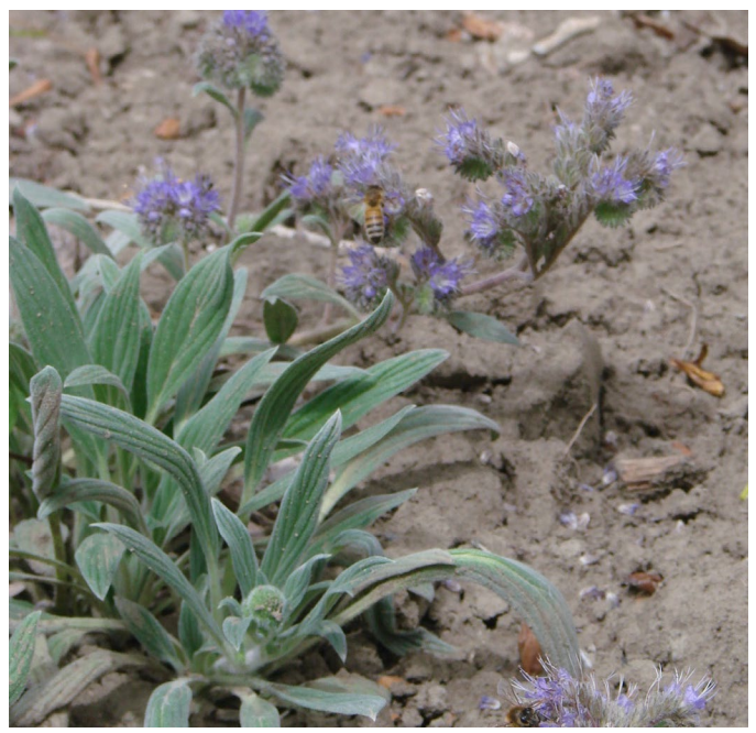
Figure 7. Bee pollinators visiting silverleaf phacelia flowers at the Plant Materials Center in Bridger, MT (2010).

Reproduction. Researchers calculated a fruit/ flower percentage average of 65% for 161 silverleaf phacelia plants growing in the Wasatch Mountains near Brighton, Utah (Wiens et al. 1987). Seed/ovule percentages averaged 27% for 21 plants when the preemergent reproductive success (PERS) or the number of viable seeds that enter the ambient environment was evaluated. Average PERS (product of fruit/flower and seed/ ovule) for silverleaf phacelia was 18% compared to 22% among all outcrossing species evaluated (Fig. 7) (Wiens et al. 1987).