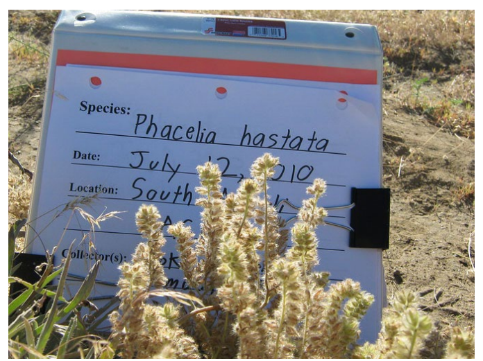
Figure 10. Silverleaf phacelia seed heads covered with bristly hairs.

If wildland-collected seed is to be sold for direct use in ecological restoration projects, collectors must apply for Source-Identified certification prior to making collections. Pre-collection applications and site inspections are handled by the AOSCA member state agency where seed collections will be made (see listings at AOSCA.org).