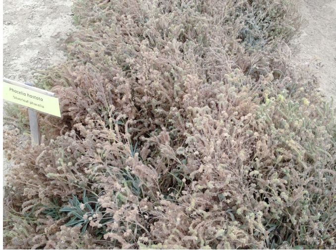
Figure 15. Silverleaf phacelia nearly ready for harvest at Oregon State University's Malheur Experiment Station in Ontario, OR.

Seed Harvesting. Seed can be hand harvested or directly combined if maturity across the field is uniform. Seed was often harvested in late June or July at OSU MES (Table 6) and in late July or early August at the Bridger PMC (LeFebvre et al. 2017b). Irrigation and fertilization improved seed production and increased seed head height for improved combine harvests at the Bridger PMC (LeFebvre et al. 2017b). At OSU MES, seed was harvested with a small-plot combine in 2014 and 2015 and manually in 2016 and 2017 when plant heights were low (Fig. 15; Shock et al. 2020).