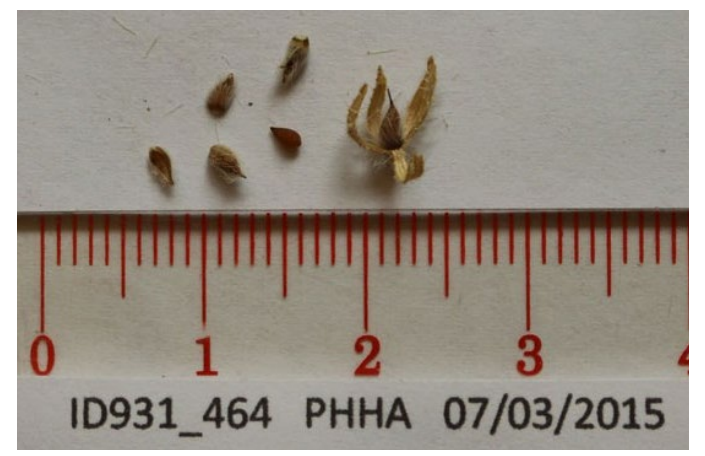
Figure 11. Silverleaf phacelia seeds and a dry capsule containg a seed.

3,615 to 4,407 feet (1,102-1,343 m) in Harney County, Oregon, and the latest was made on August 25 at 3,698 feet (1,127 m) in Boise County, Idaho (USDI SOS 2017). Seed was collected from late July to late September in Montana sites (Winslow 2002; Luna et al. 2008).