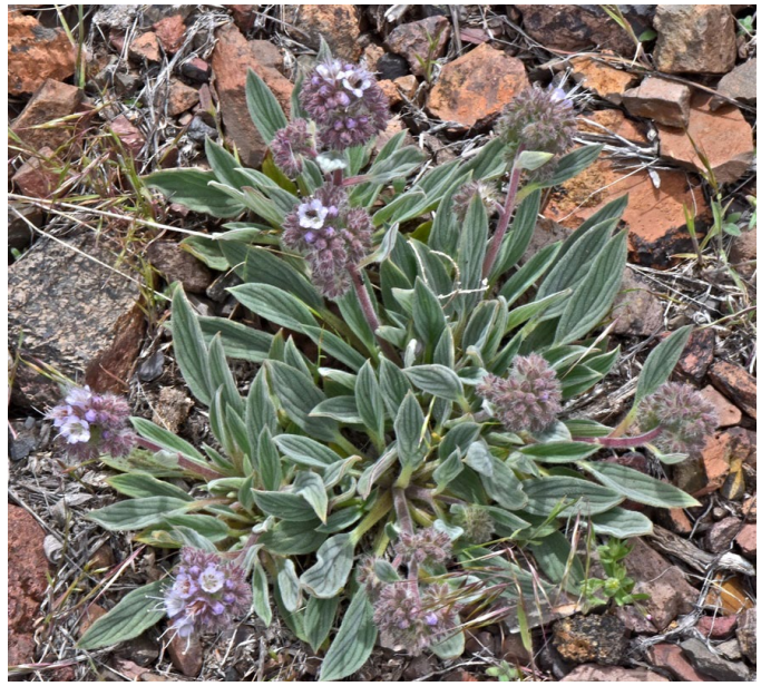
Figure 4. Silverleaf phacelia (variety compacta ) growing in rocky soils in California.

Soils. Silverleaf phacelia commonly occurs on a variety of dry, coarse-textured soils (Fig. 4) (Taylor 1992; Link 1993; Lambert 2005; Blackwell 2006; Pérez 2012). It is also found on disturbed soils from the foothills to above timberline (LeFebvre 2014).