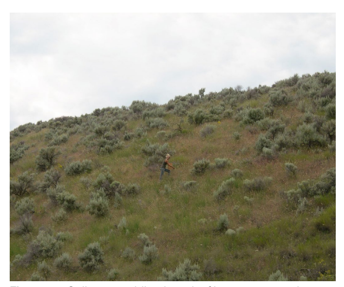
Figure 10. Collecting wildland nineleaf biscuitroot seed in a sagebrush community.

Collection methods. Wildland seed is easily hand collected by stripping or shaking umbels over a container or by clipping the inflorescences (Fig. 10; Jorgensen and Stevens 2004; Parkinson and DeBolt 2005; Skinner 2007). Seed detaches readily from the umbellets. Collections made by shaking ripe inflorescences over a container are very clean (Ogle et al. 2012).