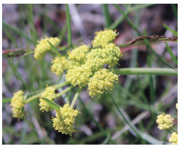
Figure 6. Nineleaf biscuitroot's compound umbel with the typical unequal ray lengths and umbellets in full bloom.

Varieties. Nineleaf biscuitroot varieties in some locations are poorly defined (Hickman 1993) and in other locations are in taxonomic flux