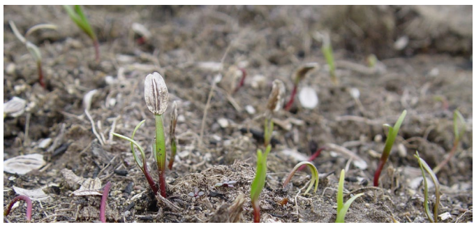
Figure 12. Nineleaf biscuitroot seedlings emerging from a southern Idaho planting.

Establishment and Growth. In its first year of growth, nineleaf biscuitroot produces few leaves and devotes energy to taproot development (Ogle et al. 2012). In the early seedling stage, nineleaf biscuitroot can be mistaken for a grass due to its linear cotyledons (Fig. 12; Pavek et al. 2012). Plants are considered established after a year and flower after 2 to 4 years of growth (Ogle et al. 2012; Shock et al. 2016). Once established, nineleaf biscuitroot is a strong perennial when protected from rodents (Shock et al. 2018). Plants green up, flower, and set seed early in the growing season (Table 6).