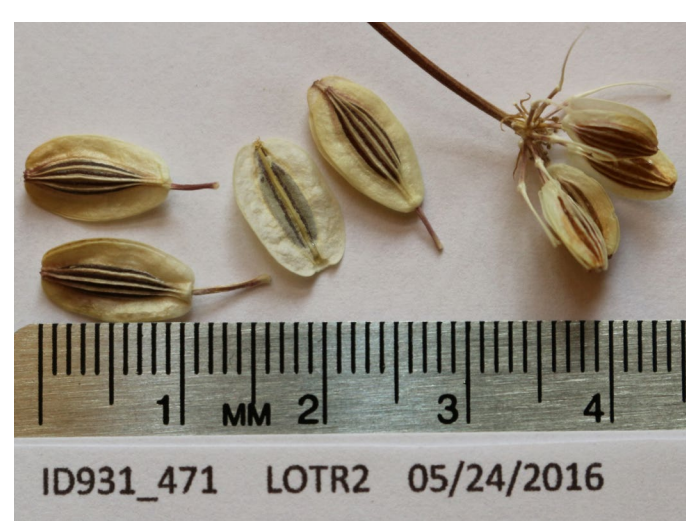
Figure 11. Nineleaf biscuitroot fruits (winged schizocarps with ribs) and a mericarp (center) with the commissure visible.

Seed Cleaning. Seed can be cleaned to high purity with minimal air screening (Ogle et al. 2012). Seeds must be handled carefully as they are fragile and brittle. Small collections can be carefully hand-rubbed to free seeds from the inflorescence then cleaned using an air column separator. Large collections require cleaning with air screen equipment (Skinner 2007).