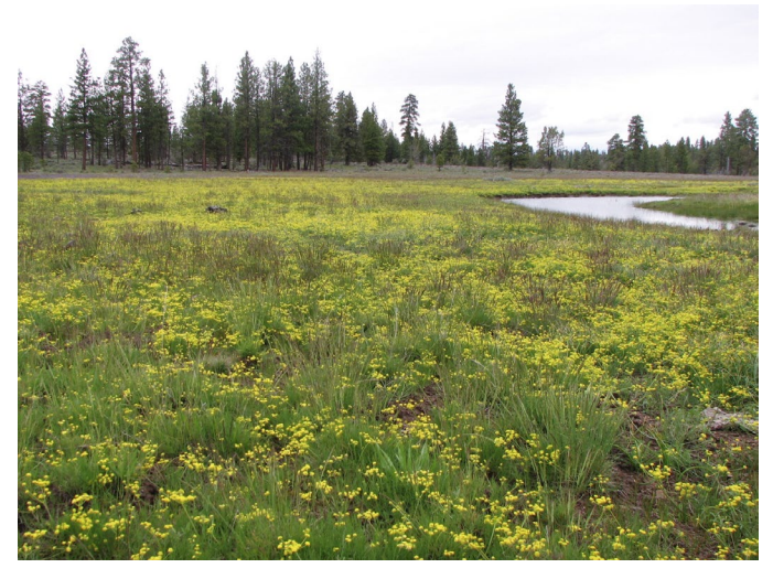
Figure 2. Nineleaf biscuitroot growing in a montane forest opening in Oregon.

woodlands where soil moisture availability was limited by layers of hard clay and duripan (Driscoll 1964; Miller et al. 2000). On pumice soils in central Oregon, nineleaf biscuitroot was most common in the driest, lowest elevation ponderosa pine/antelope bitterbrush communities (Dyrness and Youngberg 1966). In western Montana, nineleaf biscuitroot was an indicator of xeric subalpine larch ( Larix lyallii ) stands based on the species composition of 127 stands found near timberline at cold, rocky sites (Arno and Habeck 1972).