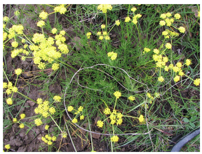
Figure 5. Nineleaf biscuitroot plant with highly dissected leaves and umbellets with small yellow flowers in compound umbels.

flowers with some male flowers, while those on shorter rays support mainly male flowers (Welsh et al. 2016; Hitchcock and Cronquist 2018). Individual flowers have five bright yellow stamens and five yellow petals, which fade to white with age (Welsh et al. 2016). Flowers produce schizocarps, which are fruits with two seeds (mericarps). Schizocarps are dry, oblong to elliptical, and 0.2 to 0.6 inch (6-15 mm) long by 0.2 to 0.4 inch wide (4-11 mm) wide (Patterson et al. 1985). Mericarps separate along their midlines when mature. Mericarps are strongly flattened, unnotched at the base and apex with 5 equal ribs on the dorsal side and thin wings along the sides (USDA FS 1937; Luna et al. 2018).