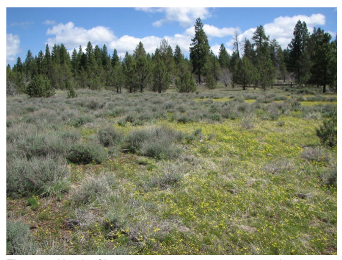
Figure 3. Nineleaf biscuitroot growing in an upper elevation sagebrush community abutting a montane forest in Oregon.

was lower in grasslands on north- (0.9 lbs/acre [1 kg/ha]; 1% freg) than south-facing slopes (7 lbs/ acre [8 kg/ha]; 32% freq) with extremely stony, silt loam soils (Shiflet 1975). Nineleaf biscuitroot was also associated with rough fescue (F. campestris)bluebunch wheatgrass and rough fescue-Idaho fescue communities in western Montana (Mueggler and Stewart 1980). In the Bitterroot Mountains, nineleaf biscuitroot was common in high-elevation grassland balds (>6000 ft [1,830 m]). The balds are considered climax vegetation and occur on south-facing slopes within the spruce-fir ( Picea-Abies spp.) zone where soils are coarsely fractured and excessive summer moisture deficiencies restrict tree establishment (Root and Habeck 1972).