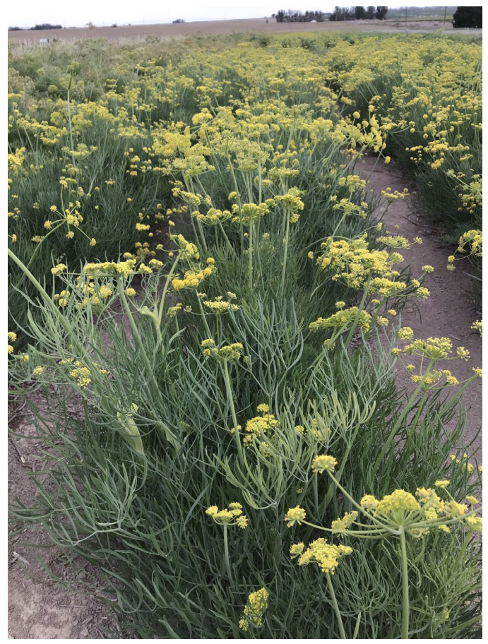
Figure 13. Nineleaf biscuitroot irrigation trial at OSU MES.

hand harvesting, and the seed required little postharvest cleaning (Tilley and Bair 2011).