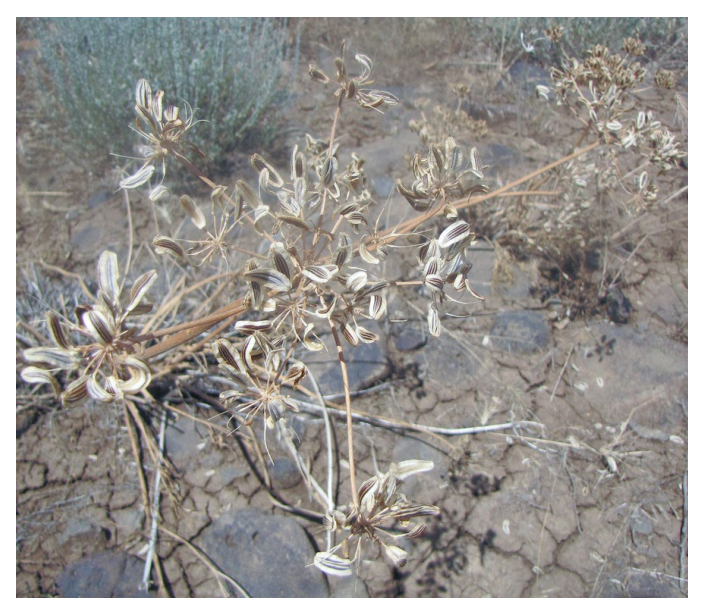
Figure 9. Nineleaf biscuitroot with mature seed dispersing.

Collection methods. Wildland seed is easily hand collected by stripping or shaking umbels over a container or by clipping the inflorescences (Fig. 10; Jorgensen and Stevens 2004; Parkinson and DeBolt 2005; Skinner 2007). Seed detaches readily from the umbellets. Collections made by shaking ripe inflorescences over a container are very clean (Ogle et al. 2012).