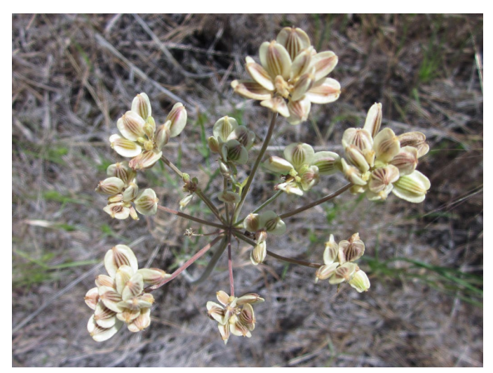
Figure 7. A single nineleaf biscuitroot compound umbel with mature fruits (schizocarps).

Above-ground seedling growth is slow, and plants produce only a few leaves in their first year because energy is devoted to taproot development (Ogle et al. 2012).