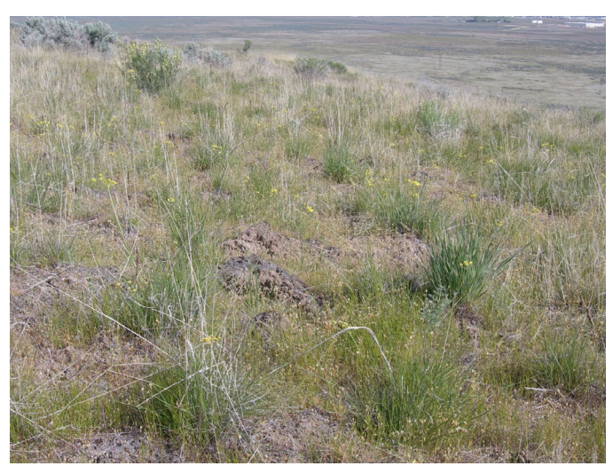
Figure 4. Nineleaf biscuitroot growing with bluebunch wheatgrass near Boise, ID.

Elevation. Nineleaf biscuitroot is most common at low and mid-elevations but also occurs at elevations up to 10,000 feet (3,000 m) (USDA FS