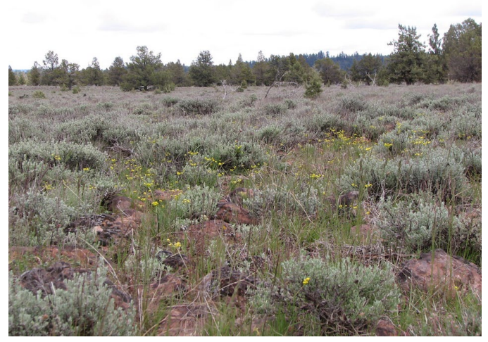
Figure 1. Nineleaf biscuitroot growing in a dry sagebrush community in Oregon.

Habitat and Plant Associations. Nineleaf biscuitroot is adapted to intense sun exposure (Fig. 1). Plants have leaves with very narrow blades that resist water loss with excessive radiation. It is common in open terrain, rocky sites, meadows, and mountain sites with high sun exposure (Daubenmire 1975a). Nineleaf biscuitroot occurs in dry to moist plains, foothills, lower and midmontane locations, and is occasional at high-elevation sites averaging 90 or more frost-free days (USDA FS 1937; Lambert 2005a; Tilley et al. 2010; Pavek et al. 2012). It occurs at sites receiving 8 to 20 inches (203-508 mm) of annual precipitation that are typically moist in spring but dry by early summer (Taylor 1992; Skinner 2007).