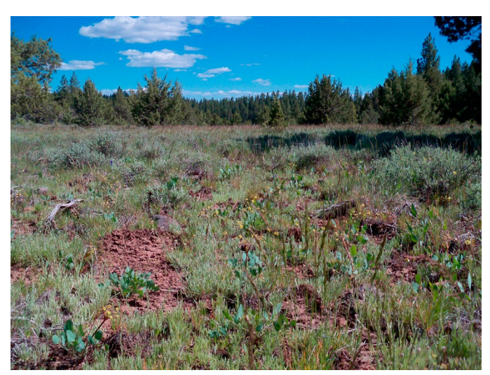
Figure 2. Barestem biscuitroot growing in an opening in a pinyon-juniper woodland in Oregon.

pinyon-juniper ( Pinus-Juniperus spp.) woodlands and pine forests (Fig. 2) (Hermann 1966; Munz and Keck 1973; Hickman 1993; Welsh et al. 2016; Hitchcock and Cronquist 2018). It is also common in Oregon white oak ( Quercus garryana ) woodlands and prairies in Oregon, Washington, and British Columbia (Pfeifer-Meister and Bridgham 2007; Marsico and Hellmann 2009). It was dominant in white oak remnant prairies at Mt. Pisgah southeast of Eugene, Oregon (Pfeifer-Meister and Bridgham 2007).