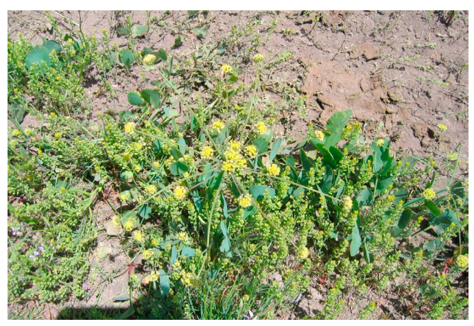
Figure 4. Barestem biscuitroot's compound umbels and tiny yellow flower clusters.

Flowers are produced in compound umbels (Fig. 4) at the ends of the tallest and stoutest flowering stems (USDA FS 1937; Lesica 2012). Umbels have 7 to 27 rays measuring 2 to 8 inches (6-20 cm) long sit atop swollen peduncles without bracts (USDA FS 1937; Hitchcock et al. 1961; Munz and Keck 1973; Blackwell 2006; Welsh et al. 2016). Rays terminate in secondary umbellets with a whorl of leafy bracts and clusters of tiny 5-petaled, yellow flowers (USDA FS 1937; Hickman 1993; Blackwell 2006; Hitchcock and Cronquist 2018). Longer outer rays generally support bisexual flowers, and shorter inner rays support primarily male flowers (Hitchcock and Cronquist 2018). Bisexual flowers produce slender, often curved or coiled styles (1-2 mm long) (Welsh et al. 2016). Fruits are schizocarps (Fig. 5) that contain two seeds (mericarps) (Welsh et al. 2016). Schizocarps are oblong, strongly flattened, 0.4 to 0.6 inch (1-1.4 cm) long, and 2 to 5 mm wide, with thin wings (USDA FS 1937; Welsh et al. 2016). The lateral wings (~0.5 mm) are narrower than the seed body. Mericarps have dorsal equal, threadlike ribs with one to several oil tubes per rib interval (USDA FS 1937; Hickman 1993; Welsh et al. 2016).