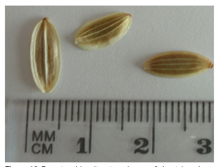
Figure 10. Barestem biscuitroot mericarps of about 1 cm long and 0.5 cm wide.

IN) with a 24 round top screen, 8 round bottom screen, medium speed, and low to medium air (Barner 2009).