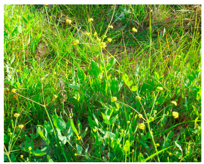
Figure 3. Barestem biscuitroot plants with petiolate pinnate leaves and oval leaflets.

Barestem biscuitroot is a glabrous perennial from a long, thick taproot (Hickman 1993; Welsh et al. 2016). At 4 to 8 years old, taproots can exceed 12 inches (30 cm) in length and are about 1 inch (2.5 cm) thick. Older plant roots growing in very sandy soils may be 3 feet (1 m) long and 6 inches (15 cm) wide (Drum 2006). Plants produce stout blue-green stalks up to 28 inches (70 cm) tall with swollen bases just below the inflorescences (Hermann 1966; Blackwell 2006). Plants in California reach greater heights (up to 28 inches [70 cm]) (Munz and Keck 1973; Hickman 1993) than those in Utah (up to 18 inches [45 cm]) (Welsh et al. 2016). Leaves are entirely or chiefly basal and rarely persistent (Hermann 1966; Welsh et al. 2016). Barestem biscuitroot produces pinnately (ternate or biternate) compound leaves with 3 to 30 distinct leaflets (Fig. 3) (Welsh et al. 2016; Hitchcock and Cronquist 2018). Leaves are petiolate and may have a dilated sheath. Petioles are up to 2.4 inches (6 cm) long for plants in Utah (Welsh et al. 2016) and up to 10 inches (25 cm) long for plants in California (Hickman 1993). Leaflets are oval to almost round, up to 2 inches (5 cm) wide, and nearly equal or up to 3 times as wide as they are long (USDA FS 1937; Taylor 1992; Welsh et al. 2016). Leaflets are often prominently veined with entire margins or with coarse teeth near the blunt tips (Hitchcock and Cronquist 2018).