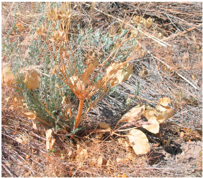
Figure 6. Barestem biscuitroot with mature schizocarps.

Seeds were also a highly valued medicine of the southern Kwakiutl Indians of British Columbia. Carbuncles were treated with chewed barestem biscuitroot seeds, which were covered with warm American skunkcabbage (Lysichiton americanus). Headaches were treated by having someone chew seeds and blow on the forehead. Chewed seeds were also applied to aches in the stomach, back, breasts, knees, or any body part. Seeds were eaten to cure constipation and sucked on to ease coughs and sore throats. Barestem biscuitroot was used with twinberry honeysuckle (Lonicera involucrata) and tobacco (Nicotiana spp.) in a steam bath for general sickness, and this water was drunk by pregnant woman to insure an easy delivery (Turner and Bell 1973).