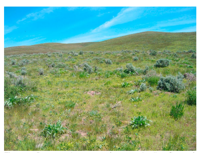
Figure 1. Barestem biscuitroot (scattered yellow flowers) growing in a sagebrush grassland.

Sagebrush (Artemisia spp.) and mountain shrublands are also common barestem biscuitroot habitats (Munz and Keck 1973; Blackwell 2006; Welsh et al. 2016). Barestem biscuitroot grows throughout the sagebrush steppe except for its eastern extremes (Taylor 1992). Cover of barestem biscuitroot exceeds 5% in threetip sagebrush/Sandberg bluegrass-onespike danthonia (A. tripartital P. sandbergii-Danthonia unispicata) communities at 5,170 feet (1,580 m) in the southern Blue Mountains of Oregon (Johnson and Swanson 2005). In eastern Oregon, eastern Washington, and extreme western Idaho, barestem biscuitroot is part of the sparse forb layer in the scabland sagebrush (A. rigida) rangeland cover type (Shiflet 1994). On the western margin of the Great Basin, barestem biscuitroot occurs in low sagebrush (A. arbuscula) communities dominated by native species but not those dominated by medusahead (Taeniatherum caput-medusae) (Young and Evans 1970).