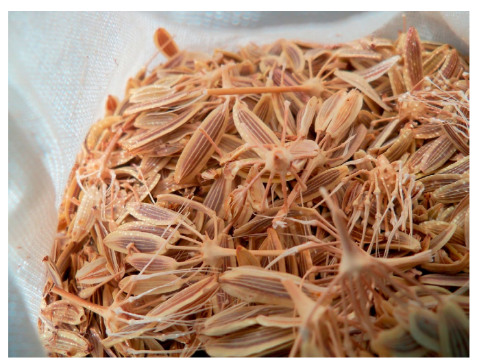
Figure 7. Barestem biscuitroot seed collection with many schizocarps and detached umbellets.

Developing a seed supply begins with seed collection from native stands (Fig 7). Collection sites are determined by current or projected revegetation requirements and goals. Production of nursery stock requires less seed than large-scale seeding operations, which may require establishment of agricultural seed production fields. Regardless of the size and complexity of any revegetation effort, seed certification is essential for tracking seed origin from collection through use (UCIA 2015).