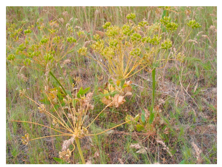
Figure 5. Barestem biscuitroot with fruits (schizocarps).

Breeding system and pollination. Barestem biscuitroot produces male and bisexual flowers. The bisexual flowers develop female parts before male parts. Flowers are primarily pollinated by bees, but because there in an overlap in the timing of sexual function between and within umbels, self-pollination is possible (Schlessman 1982; Cruden 1988). Fruit set for flowers freely visited by pollinators was 60 times that of flowers protected from pollinators for other Lomatium species (Cane et al. 2020).