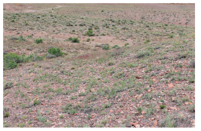
Figure 3. Shaggy fleabane growing with grasses and other forbs on a rocky site in Utah.

Soils. Shaggy fleabane grows on a variety of substrates and commonly occurs on well-drained sandy to gravelly soil textures (Fig. 3) (Taylor 1992; Welsh et al. 2016; USU Ext. 2017).