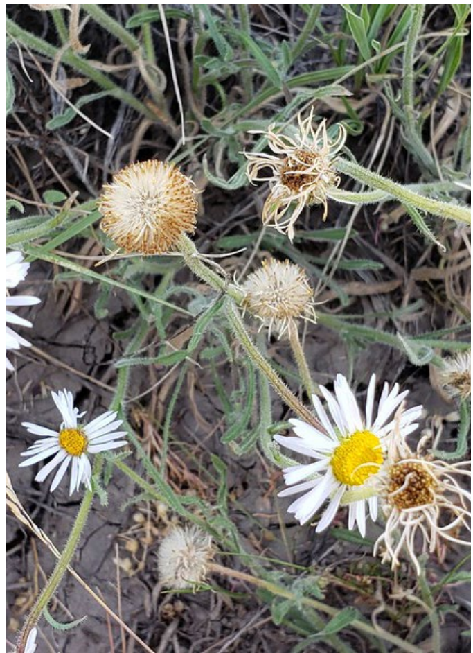
Figure 8. Shaggy fleabane plant growing in Idaho. This plant has flowering stems with mature seed, drying flowers, and fresh flowers.

to making collections. Pre-collection applications and site inspections are handled by the AOSCA member state agency where seed collections will be made (see listings at AOSCA.org).