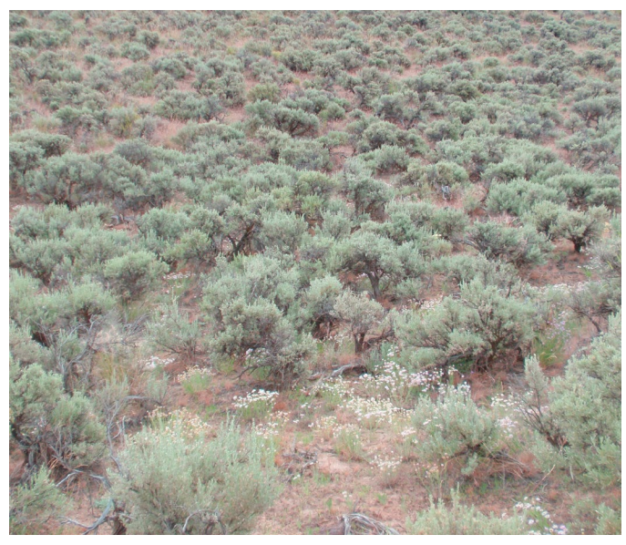
Figure 2. Shaggy fleabane growing in a big sagebrush shrubland in Oregon.

in dry basin big sagebrush (A. tridentata subsp. tridentata) types, which occur below 7,000 feet (2,000 m) in eastern Washington, southern Idaho, Montana, Wyoming, and south to Arizona and New Mexico. It occurs in Wyoming big sagebrush (A. t. subsp. wyomingensis) communities, which occupy a range like that of basin big sagebrush communities but includes parts of Colorado, Nevada, and northeastern California. Shaggy fleabane grows in threetip sagebrush (A. tripartita) shrublands of relatively high-elevation sites (4,000-9,000 feet [1,200-2,700 m]) in Washington, eastern Oregon, southern Idaho, southwestern Montana, Wyoming, and northern Utah and Nevada. It occurs in black sagebrush (A. nova) communities found at middle elevations in southern Idaho, western Wyoming, Colorado, Utah, and Nevada (Shiflet 1994). When forb species composition was evaluated at 15 big sagebrush (A. tridentata)-dominated sites in Oregon, Nevada, Idaho, Utah, Colorado, Wyoming, and Montana, shaggy fleabane was sampled at 6 sites (Pennington et al. 2017).