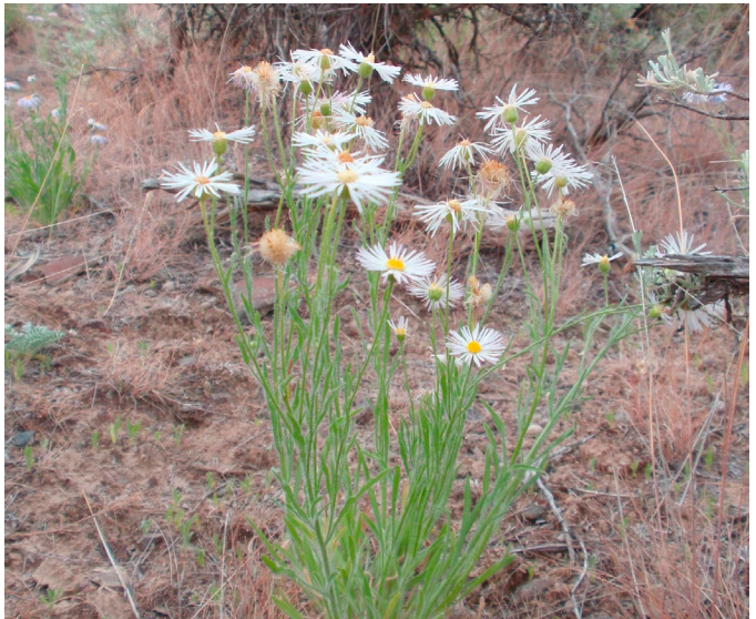
Figure 4. Shaggy fleabane plant with fuzzy stems and leaves growing in Oregon.

Shaggy fleabane is a short- to long-lived perennial from a woody taproot and caudex with short, thick branches (Nesom 2006; Welsh et al. 2016). Caudex branches are typically clothed by withered leaf bases (Welsh et al. 2016). Plants are variable, ranging from rather stout to slender, 2 to 20 inches (5-50 cm) tall. Stems and leaves are often densely covered with spreading hairs of more than 1 mm long, giving the plant a shaggy or unkempt appearance (Fig. 4) (Taylor 1992; Hitchcock and Cronquist 2018; Luna et al. 2018).