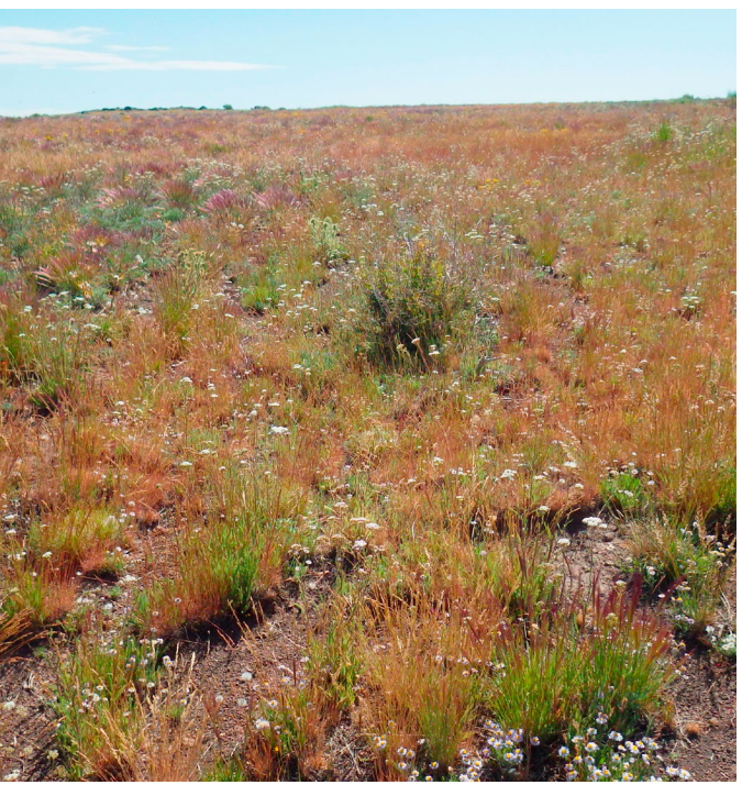
Figure 1. Shaggy fleabane (lower right) growing in a grassland community in Oregon used as a seed collection area by the Bureau of Land Management's (BLM) Seeds of Success program.

A bluebunch wheatgrass-Sandberg bluegrassshaqqy fleabane community occupied hot, dry sites in the Blue Mountains of southeastern Washington, northeastern Oregon, and westcentral Idaho (Powell et al. 2007). In the Snake River Canyon in Idaho and adjacent Washington and Oregon, shaggy fleabane constancy was 55% in wheatgrass-plains pricklypear (Agropyron spp./ Opuntia polyacantha) communities on southwest slopes, 44% in Idaho fescue (Festuca idahoensis)/ wheatgrass grasslands on northeastern slopes, and 33% in wheatgrass-Sandberg bluegrass grasslands on western slopes and in Idaho fescue/ prairie Junegrass (Koeleria macrantha) grasslands on northeastern slopes (Tisdale 1979). In southern Saskatchewan, shaggy fleabane occurred in rough fescue (F. campestris) mixed prairie (Coupland and Brayshaw 1953).