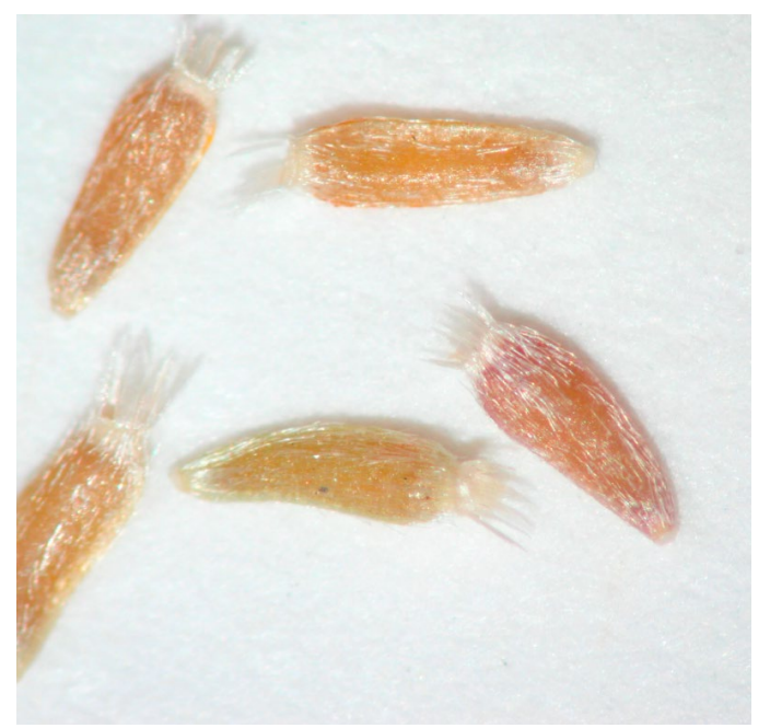
Figure 10. Shaggy fleabane seeds under magnification. Seeds were cleaned and the photo provided by USFS Bend Seed Extractory.

Seed Cleaning. Several mechanical cleaning methods have been described. The Bridger, Montana, Plant Materials Center (PMC) cleaned small quantities of fleabane seed using a blender with duct tape-wrapped blades. Blenders were filled up to 33% and pulsed at low speed. Blending was followed by sieving and winnowing over a small fanning mill (Scianna 2004). The USFS Bend Seed Extractory cleaned small seed lots (Fig. 10) using a small brush machine (mantle #32, speed 1, and medium bristle brushes) followed by hand-sieving with a #40 USGS screen and then processing with an office clipper (DeBolt 2016).