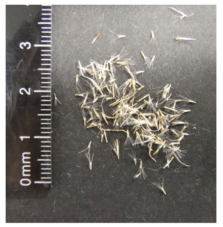
Figure 9. Collection of about 40 freshly collected seeds from shaggy fleabane plants in Idaho.

Collection methods. Wildland seeds (Fig. 9) can be collected by shaking or knocking seed heads into a container or by picking mature seeds from the seed heads (Camp and Sanderson 2007; DeBolt 2016; USDI BLM SOS 2017).