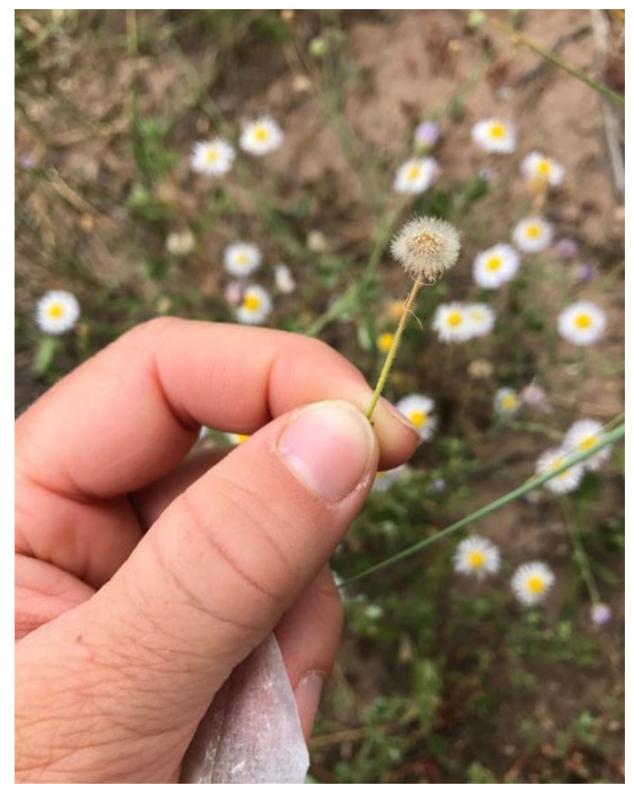
Figure 6. Shaggy fleabane seed head.

Reproduction. Shaggy fleabane reproduces by seed (Fig. 6) (Marlette and Anderson 1986; Pinto et al. 2014). Seeds are generally produced 1 to 2 months after flowers (Pitt and Wikeem 1990). Flower production (abundance and timing) can vary by location and year (Tepedino and Stanton 1980).