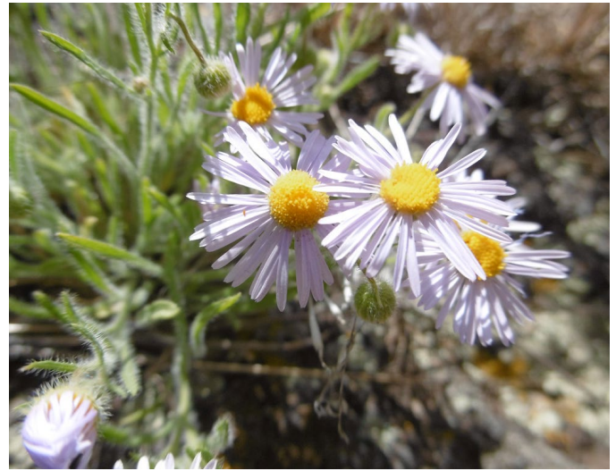
Figure 5. Small shaggy fleabane flowers.

Individual plants produce up to 50 flat-topped to hemispheric flower heads, which often occur singly at the top of stems (Hickman 1993; Nesom 2006; Pavek et al. 2012; Welsh et al. 2016; Hitchcock and Cronguist 2018). Individual heads have 50 to 150 rays, which are pistillate, fertile, white to pink or lavender, and 6 to 15 mm long (Fig. 5). Ray flowers are thin, reflexed or sometimes weakly coiled, and surround yellow to orange disk flowers. Disk corollas are fertile, 3 to 5 mm tall with distinctly indurate and inflated throats (Nesom 2006; Welsh et al. 2016; Hitchcock and Cronguist 2018). Involucres are hairy, 7 to 15 mm wide, and 4 to 7 mm tall with subequal bracts in 2 to 4 series (Nesom 2006; Welsh et al. 2016; Hitchcock and Cronquist 2018; Luna et al. 2018). Bracts are covered with tiny glands, long hairs, and have orange to yellowish or brownish midribs (Nesom 2006; Welsh et al. 2016; Luna et al. 2018).