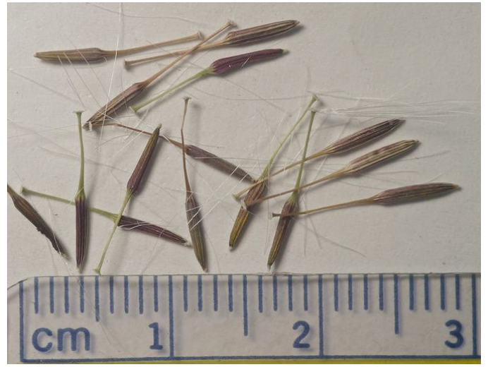
Figure 10. Individual orange agoseris seeds with visible ribs and stigma and style still attached.

Post-collection management. Jensen (2007) recommends storing seed (Fig. 10) in breathable bags in cool, dry, rodent-free conditions until it can be cleaned.