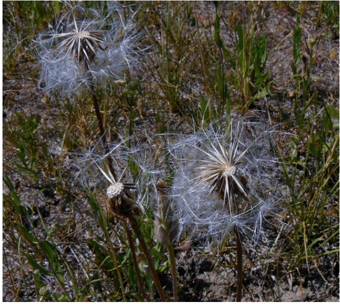
Figure 9. Mature orange agoseris seed heads dispersing seed. Photo: J. Pawek, CalPhotos, 2010.

Collection methods. Because orange agoseris plants typically occur in low densities, wildland seed is hand collected. Seeds are hand stripped by clasping the base of the seed head between two fingers and pulling upward while keeping the hand closed to reduce losing mature seeds (Jensen 2007).