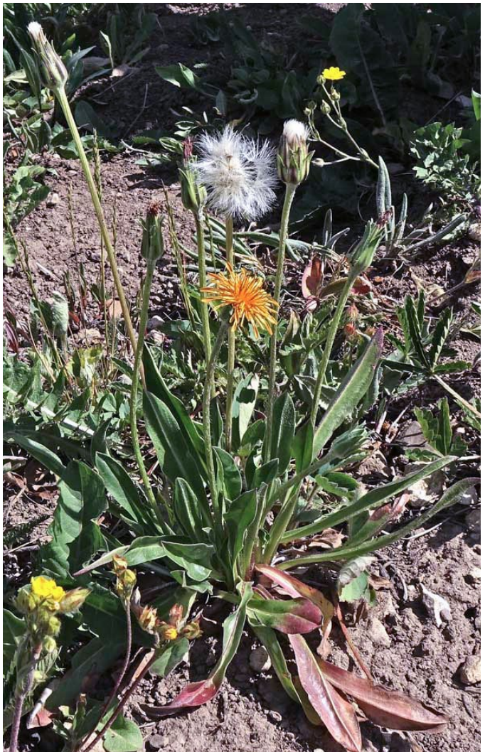
Figure 6. Single orange agoseris plant producing both flowers and seeds (indeterminate growth).

Reproduction. Orange agoseris flowers from May to September (Baird 2006; Jensen 2007), and seed typically ripens from May to September (Jensen 2007; PFAF 2021). Plants produce one to three seed heads each year but may produce more flowering stalks if soil moisture is not limited (Fig. 6) (Jensen 2007).