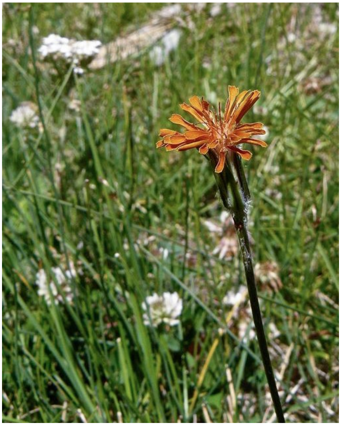
Figure 1. Orange agoseris growing in a meadow in California. Photo: J. Pawek, CalPhotos, 2012.

The following studies describe some of the species and plant communities associated with orange agoseris at sporadic sites throughout its range. Descriptions of plant associations from orange agoeris' southern-most range are lacking. In Alberta, orange agoseris occurs with alpine timothy (Phleum alpinum) and tufted hairgrass (Deschampsia caespitosa) in alpine meadows at the forest-tundra ecotone (Heusser 1956). Orange agoseris occurs in several subalpine meadows in the Olympic Mountains in Washington. It was most common in mesic Idaho fescue (Festuca idahoensis) grasslands occupying dry south- to west-facing slopes from 5,150 to 5,550 feet (1,570-1,690 m) elevations in the northeastern part of the mountain range. These grasslands occupy relatively steep slopes and are snowfree by mid-June. Orange agoseris was next most common in cushion plant communities on moderately steep to steep south- to southwest facing slopes between 5,050 to 5,250 feet (1,540-1,600 m). The cushion plant communities occupy windy sites that are snow-free by early May and experience frequent spring freezing and thawing (Kuramoto and Bliss 1970). In Mount Rainier National Park, Washington, orange agoseris occurs in Sunrise Meadows with poorly developed soils dominated by greenleaf fescue (F. viridula) and broadleaf lupine (Lupinus latifolius) (Frank and del Moral 1986).