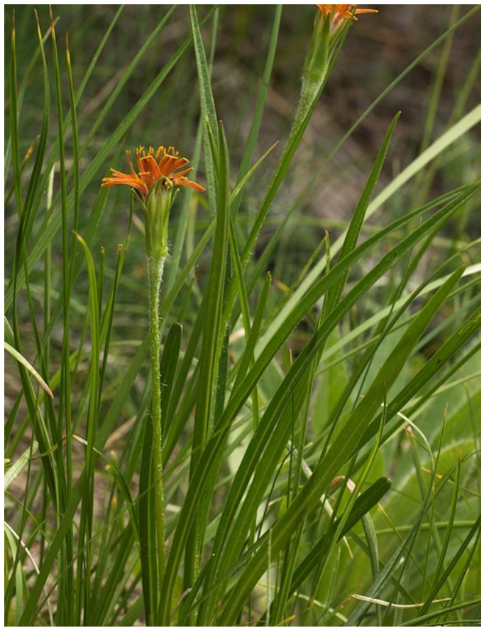
Figure 3. Orange agoseris plant in flower growing in Blaine County, Idaho.

Orange agoseris is a perennial scapose herb (Fig. 3) from a simple to branched caudex and strong, deep taproot (USFS 1937; Munz and Keck 1973; Welsh et al. 2016). Herbage is glabrous to villous and exudes a milky juice when damaged (Spellenberg 2001; Welsh et al. 2016). Leaves are entirely basal, erect to decumbent with leaf blades 1.4 to 15 inches (3.5-38 cm) long and 0.1 to 1.2 inches (0.3-3 cm) wide (Baird 2006). Leaf blades are narrow, linear to oblanceolate, and broadest at the middle (Spellenberg 2001). Leaf margins range from entire or with several teeth or lobes occurring in 2 to 4 pairs (Baird 2006). Flowers are produced individually at the ends of upright leafless stalks (Spellenberg 2001).