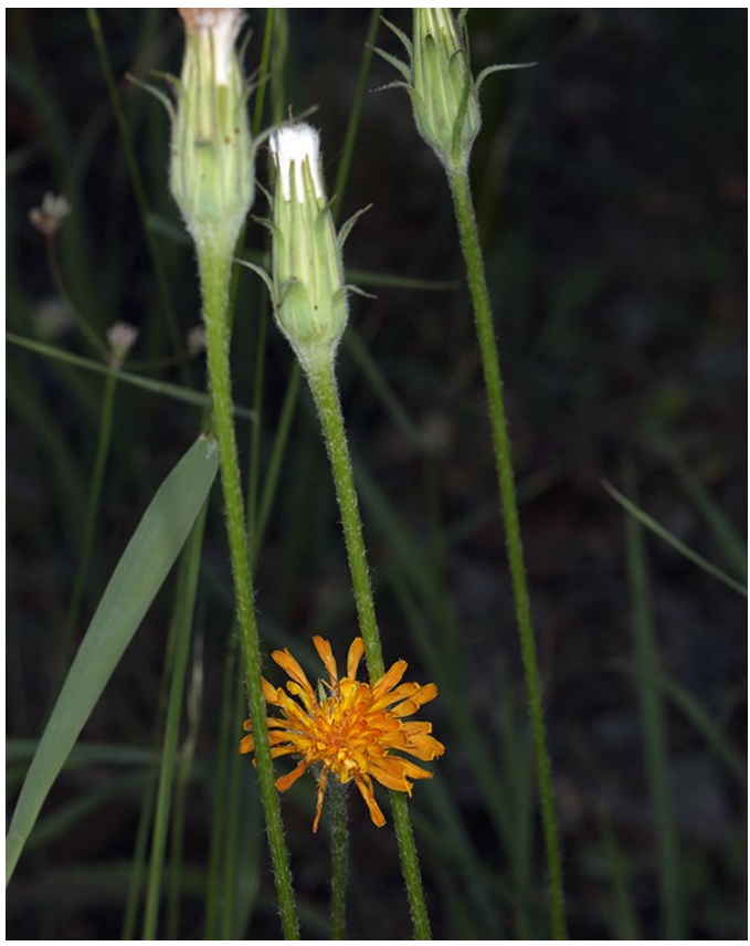
Figure 8. Orange agoseris flowering and just starting to produce seed.