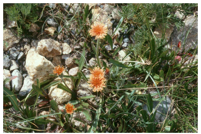
Figure 2. Orange agoseris growing at a rocky site in California. Photo: G.A. Monroe, CalPhotos, 1987.

shallow limestone sands (Merkle 1962). Both orange agoseris varieties occur in high-altitude meadows in Boulder Park, northern Colorado, which are concentrated on moist, gravelly soils. These high-altitude meadows are well supplied with moisture, but the climate is severe, and frosts occur nearly every week (Reed 1917). In Oregon's Cascade Range, orange agoseris grows in meadow openings of montane conifer forests where soils are deep (>5.6 feet [1.7 m]), very fine sandy loams (Halpern et al. 2014). In the Crested Butte area of west-central Colorado (10,500-11,500 ft [3,200-3,500 m]), orange agoseris averaged 0.5% cover on 60-year-old burn scars on heavy clay-textured soils (Langenheim 1962). On Deer Ridge in Olympic National Park, Washington (5,250-5,580 ft [1,600-1,700 m]), orange agoseris occurs in meadows with weakly developed, sandy soils. Moisture content of these soils ranged from 8.5 to 25.4% between mid-June to early September (del Moral 1983a).