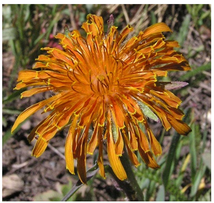
Figure 4. Orange agoseris flower head with lobed ligulate florets the inner of which being shorter than the outer.

Orange agoseris produces cylindric cypselae fruits, but these are often referred to as achenes in the literature. The cypselae have 0.4 to 0.6inch (0.9-1.5 cm) long pappi of capillary bristles arranged in a two or three series (Baird 2006; Welsh et al. 2016). Cypselae are 10-ribbed, 4 to 9 mm long, with slender beaks. The beaks are often more than half as long as the cypselae bodies (Munz and Keck 1973; Welsh et al. 2016; Hitchcock and Cronquist 2018).