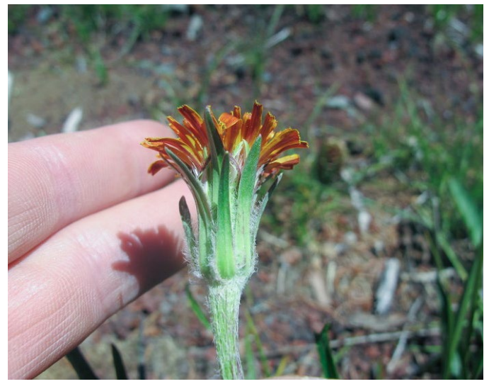
Figure 5. Tomentose orange agoseris involucre enclosing the flower head.

Varieties. The Flora of North America suggests that varieties are best distinguished by the involucre bracts and the beaks and ribs of cypselae (Baird 2006).