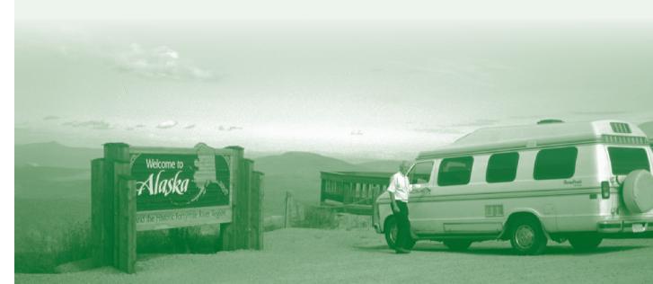
Davis Dome Wayside, Top of the World Highway

Elevation 4,127 ft (1,258 m). United States and Canada customs offices are open only during the summer months, usually from May 15 to September 15. Dates can vary so call ahead (907-774-2252) to be sure. Hours are from 8 a.m. to 8 p.m. Alaska time. The Top of the World Highway continues to historic Dawson City and the Klondike gold fields.