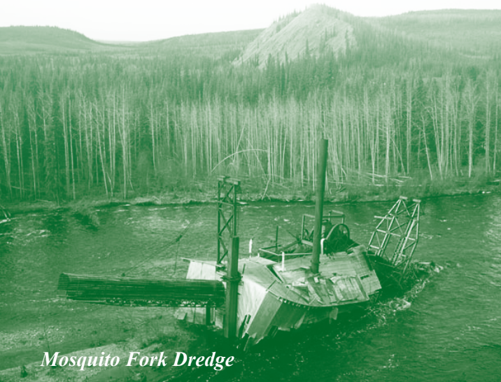
Mosquito Fork Dredge