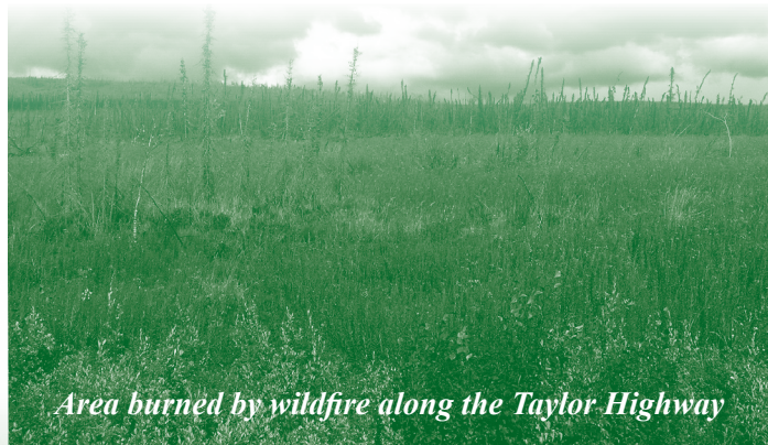
Area burned by wildfire along the Taylor Highway

Wildfires in 2004 and 2005 burned much of the spruce forest along the highway, clearing the way for new growth. As you travel the highway, notice how the area is regenerating. Pink fireweed and fresh green clumps of willows are the first plants to spring up in the blackened landscape. Cottongrass and blueberry shrubs get an infusion of nutrients from the burned forest, growing thick and lush. In some areas, birch trees are replacing the burned-over spruce in a process that will take several decades.