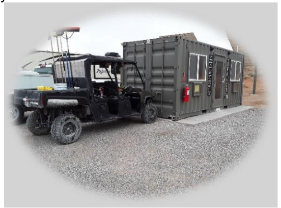
Campground host office

The Red Rock Campground's facilities and reservation system was improved in FY20 with the addition of a campground office, Wi-Fi service for the campground office and related tablets to improve the reservation, check-in/check-out system. This resulted in a significant increase in funds for the 1232 account, increased security and visitor accountability for fee payments.