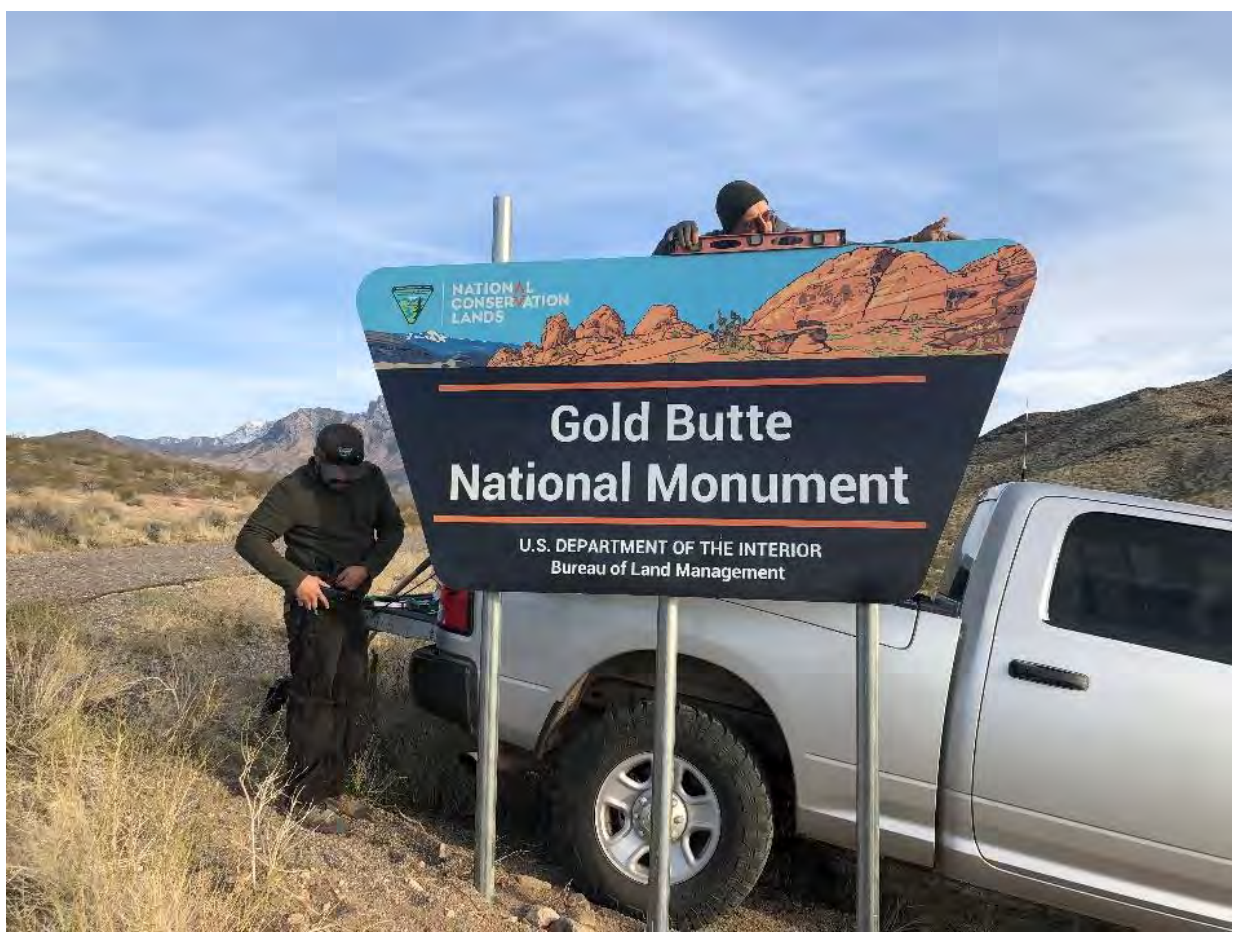
Installation of a new monument portal sign.

A road survey was conducted of the byway between Riverside Road and Whitney Pocket. Planning is ongoing for road improvements to the 21 mile stretch of the Byway to improve public access and safety.