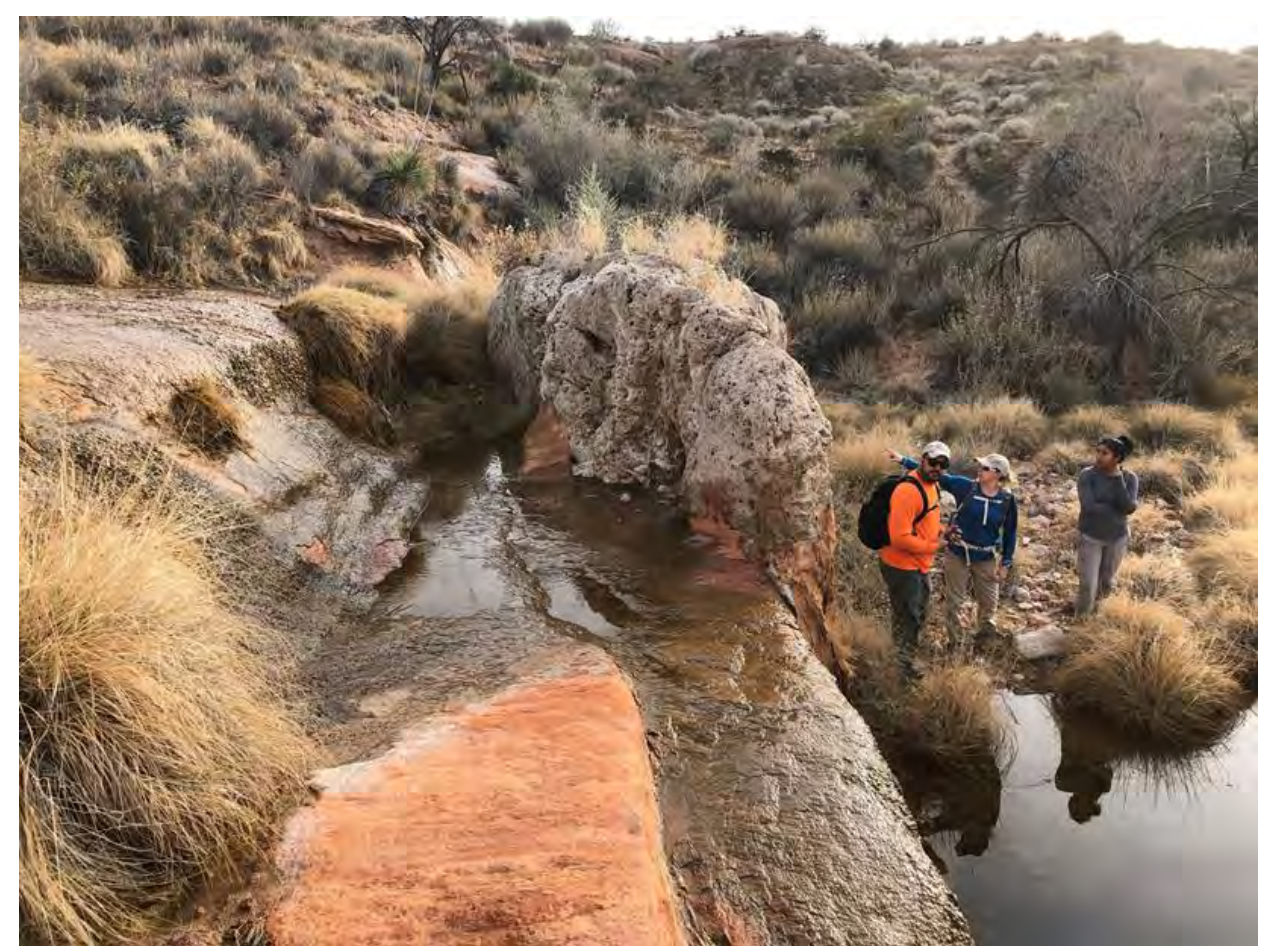
Red Rock Springs Monitoring Site Visit by USGS and BLM Resource Staff

Researchers with the USGS Nevada Water Science Center are currently collecting and analyzing water samples from Bear Poppy, Horse, Quail, and Red Rock Springs in Gold Butte National Monument to provide information on possible sources of water to the springs. The water samples are being analyzed for major ions, trace elements, stable isotopes of hydrogen and oxygen, dissolved gasses, chlorofluorocarbons (CFCs), sulfur hexafluoride (SF6), and tritium/helium. The analyses is performed at the USGS National Water Quality Lab (NWQL), the USGS Reston Stable Isotope Laboratory (RSIL), and the USGS Reston Groundwater Dating Lab (RGDL). The results of laboratory analyses will be accessible to the public from the USGS National Water Inventory System web portal.