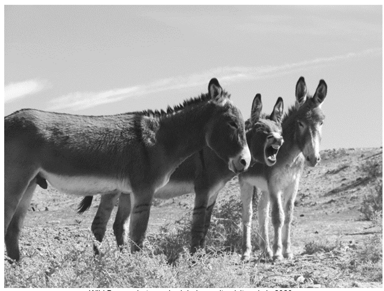
Wild Burros photographed during a site visit early in 2020.