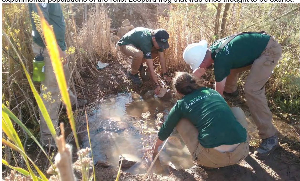
An NCC crew at Bearpaw Poppy Spring installs a relict leopard frog breeding pool.

Restoration of riparian and aquatic habitat at three springs in Gold Butte began in earnest during FY 2020 and will continue in the next four years as part of an interagency effort across southern Nevada. These projects aim to improve hydrologic conditions and riparian and aquatic habitat for a rich assemblage of species including experimental populations of the relict Leopard frog that was once thought to be extinct.