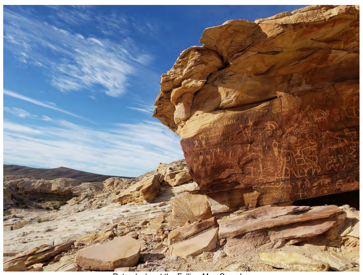
Petroglyphs at the Falling Man Complex

GBNM contains an extraordinary variety of diverse and irreplaceable historic and prehistoric cultural resources, including many sites important to the history and identity of Native Americans, and remnants of our Western mining and ranching heritage. The landscape reveals a story of thousands of years of human interaction with this harsh environment and provides a rare glimpse into the lives of Nevada's first inhabitants, the rich and varied indigenous cultures that followed, and the eventual arrival of Euro-American settlers.