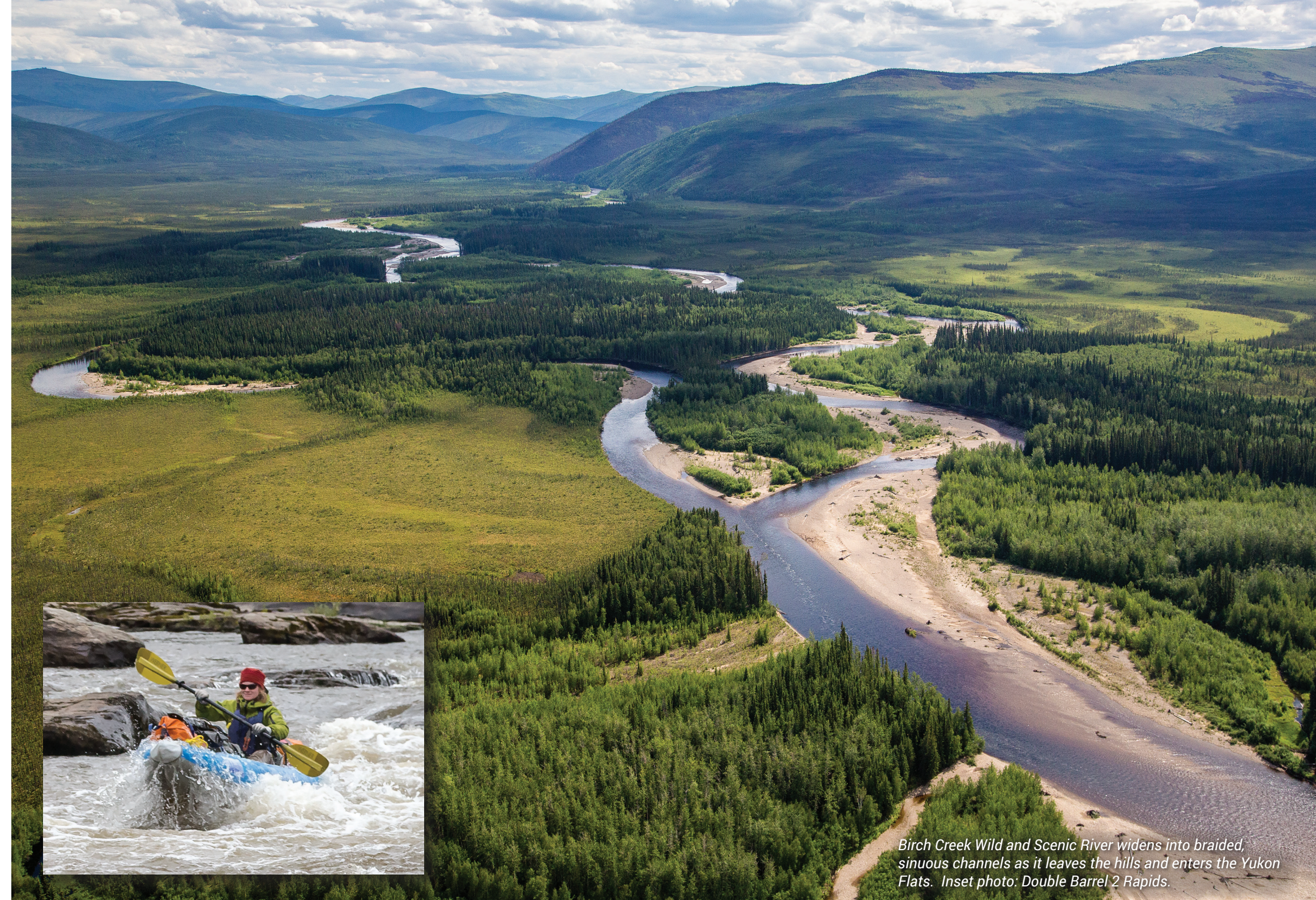
Birch Creek Wild and Scenic River widens into braided, sinuous channels as it leaves the hills and enters the Yukon Flats. Inset photo: Double Barrel 2 Rapids.