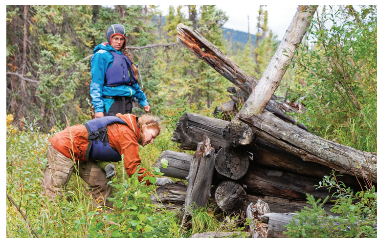
Two visitors explore the ruins of a log cabin.

Entrepreneurs followed the gold seekers, blazing trails, freighting goods, and establishing road houses. Old miner and trapper cabins dot the landscape along the river. Remember, these structures and artifacts belong to everyone. Take only pictures, leave only footprints.