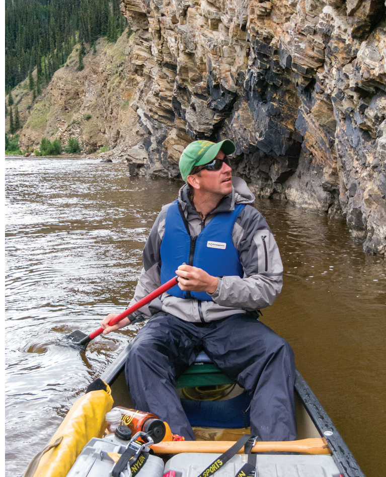
Bluffs along Birch Creek are a great place to observe peregrine falcons and other raptors.

For some people, Birch Creek represents an unforgettable float experience that offers not only quiet enjoyment of nature but also convenient road access at either end. For others the river provides entry to moose habitat during hunting season. And for still others, Birch Creek's transition from a swift headwater stream to a broad, meandering river presents a special window into the "life stages" of an Interior Alaska waterway.