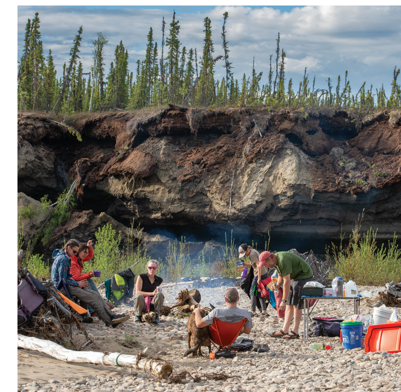
A group of boaters camp on a gravel bar next to a riverbank where melting permafrost is exposed.

Also exposed in cutbanks along Birch Creek are melting ice wedges, part of the permanently frozen soils, or permafrost, underlying much of the river valley. Forests of short, stunted black spruce, deep sedge tussocks, and thick stands of willows grow above the permafrost in the shallow layer of soil that thaws for a few months each summer.