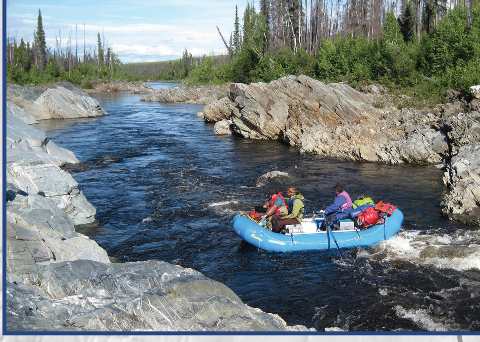
Rafting through Shotgun Rapids on Birch Creek.

Pinnell Mountain National Recreation Trail