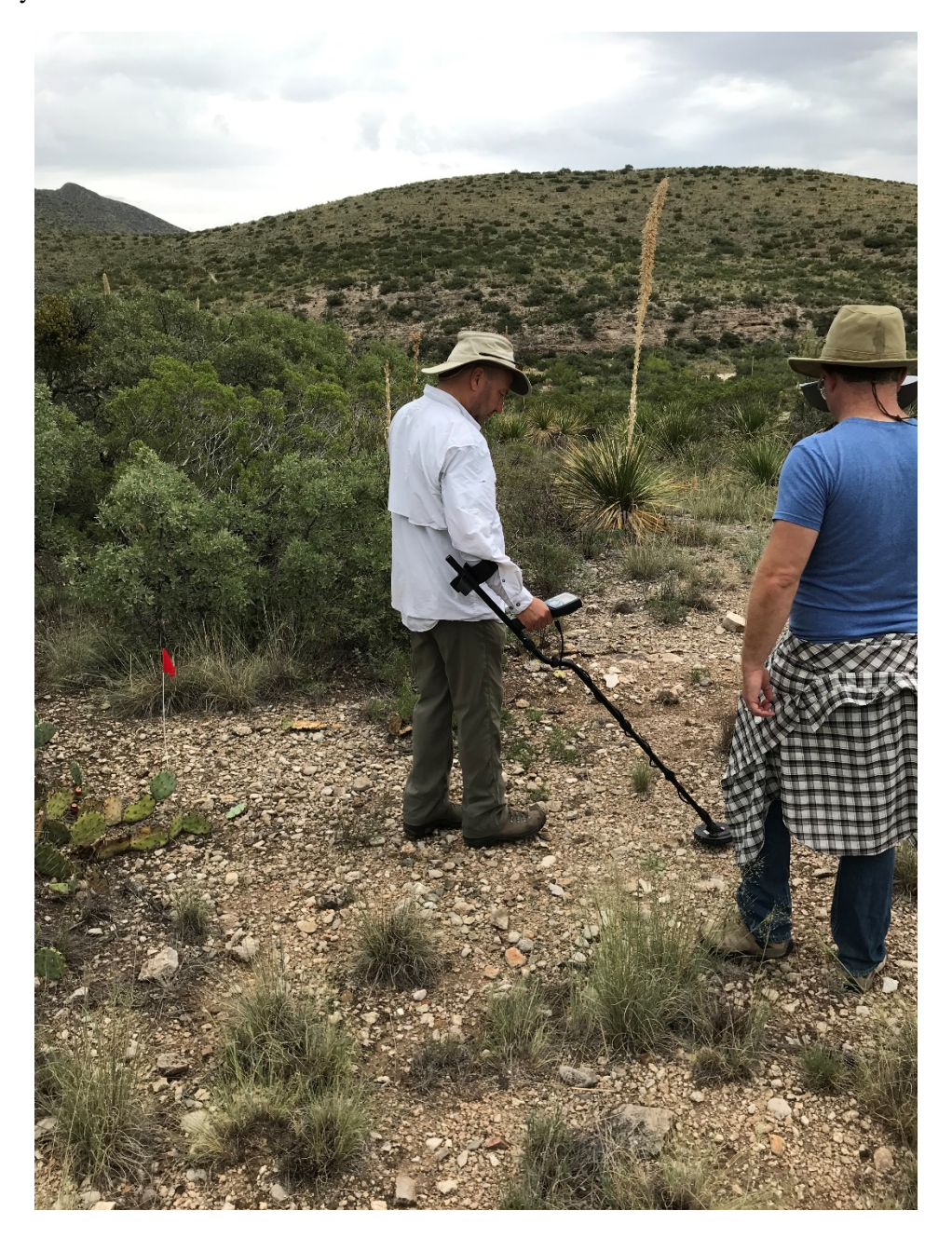
Figure 2. Students use metal detectors at an historic Mescalero Apache site. Find spots are marked with red flags.

a natural defensive stronghold within secluded drainages and canyons. Their security was challenged during November-December 1869, when a cavalry unit attacked and destroyed three rancherías. This military action ultimately forced many of the Mescalero to abandon the Guadalupe Mountains and surrender themselves to military authorities at Fort Stanton, NM. Archaeological evidence suggests the AMDA field session was conducted on one of rancherías that was attacked and destroyed by the U.S. cavalry in 1869.