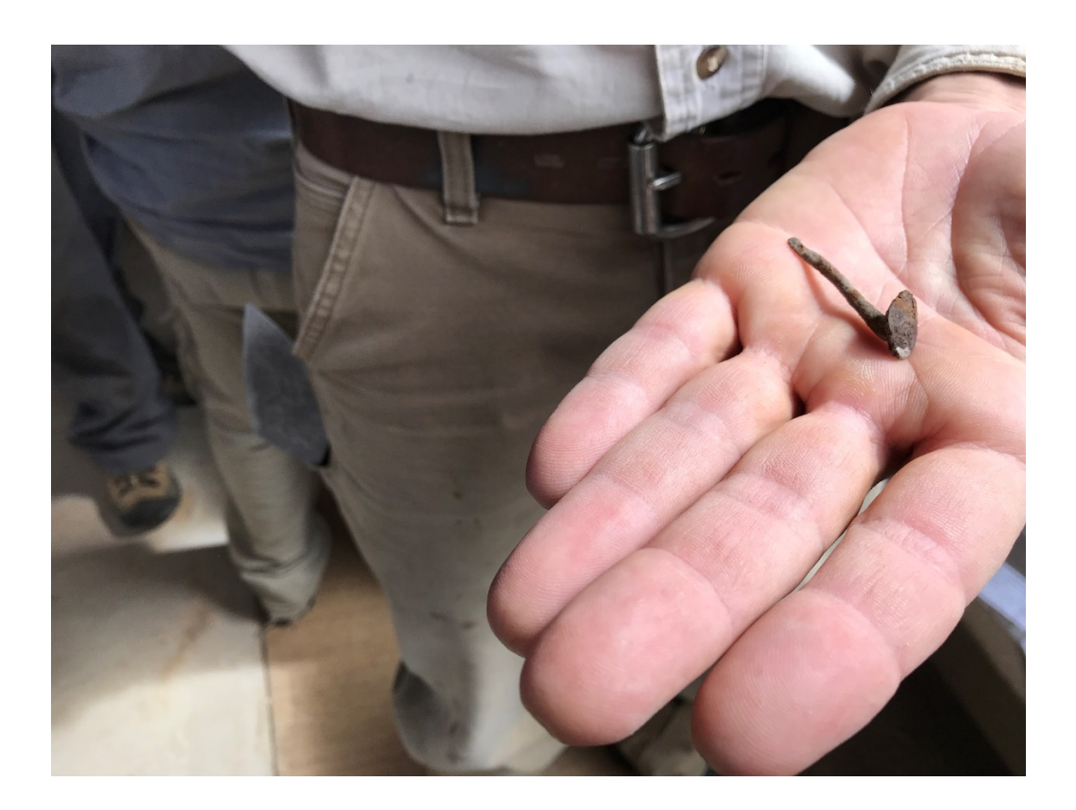
Figure 4. A hand-forged nail was one of the metal detector finds.

Class members were complimentary about the class and for the opportunity to learn so much in a short period of time. For those members who had never used a metal detector before the class was a unique experience, but one that they hoped to repeat in the near future.