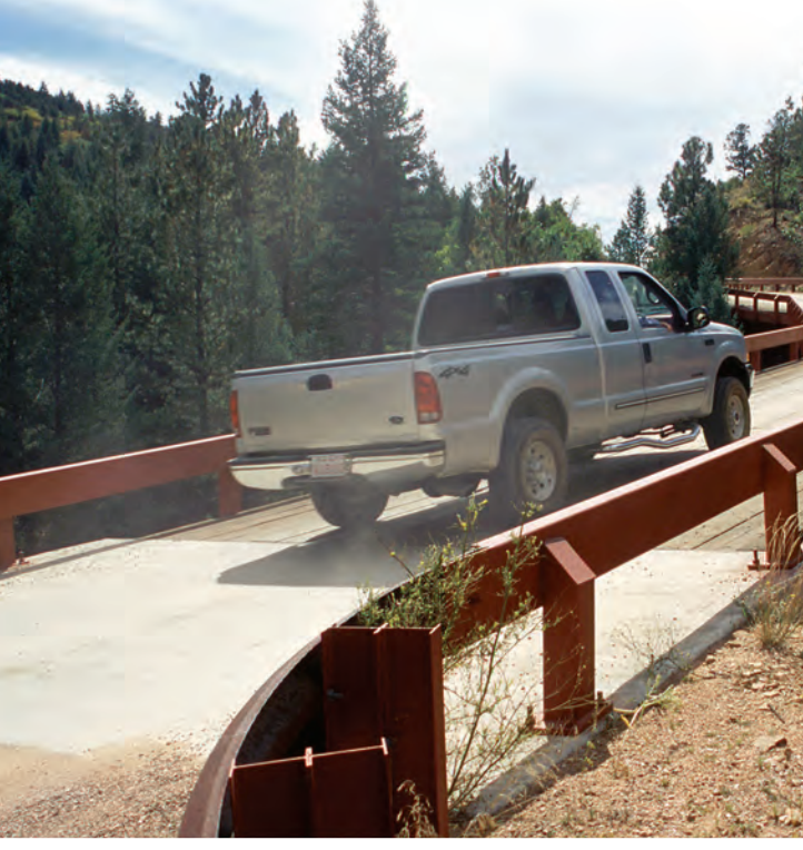
Gold Belt Tour Back Country Byway, CO

Rediscover the splendor of the West's public lands by traveling the adventurous routes of the Bureau of Land Management's Back Country Byways. As a unique part of the National Scenic Byways Program, Back Country Byways can lead you on less-traveled roads through alpine meadows and soaring mountains to sagebrush prairie and saguaro cactus desert. Choose a route to explore whether driving an air-conditioned car, four-wheel drive or dirt bike.