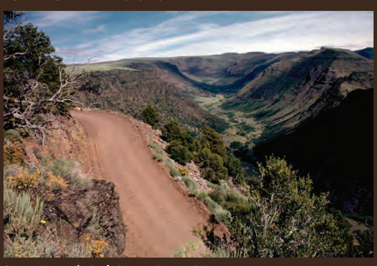
Steens Mountain Back Country Byway, OR