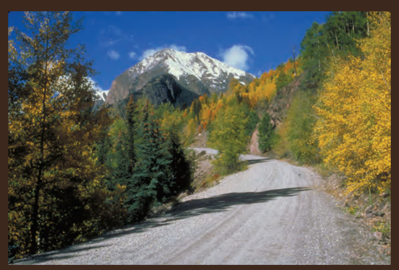
Alpine Loop Back Country Byway, CO