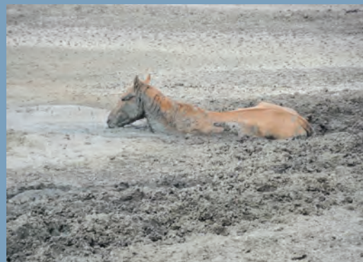
A wild horse in a drying lake bed in Oregon. The BLM conducted an emergency gather in 2014 to remove imperiled horses from this herd.