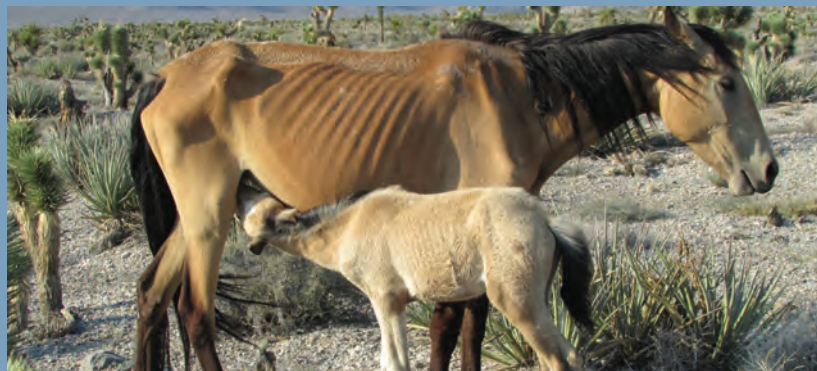
A wild horse mare and foal in very poor condition in Nevada because of lack of forage. In 2015, the BLM conducted an emergency gather of these horses.

As wild horse and burro populations rise, there are serious consequences for the animals and the land. Horses and burros starve, dehydrate and wander onto private property or highways. Land health and habitat for sage grouse and other wildlife is being compromised.