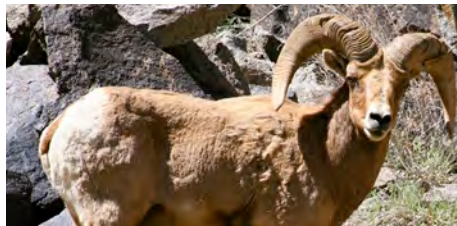
Desert bighorn sheep