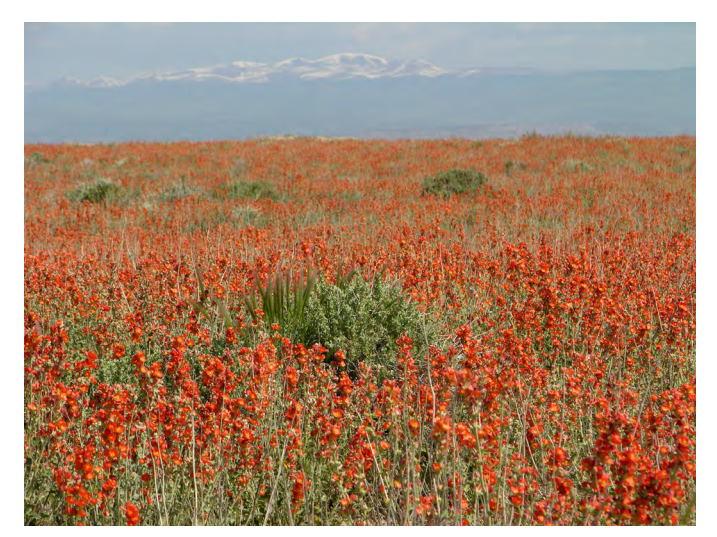
Figure 6. Extensive stand of small-leaf globemallow growing in the south-central portion of Utah's Uintah Basin.

Seed Sourcing. Because empirical seed zones are not currently available for small-leaf globemallow, generalized provisional seed zones developed by Bower et al. (2014), may be used to select and deploy seed sources. These provisional seed zones identify areas of climatic similarity with comparable winter minimum temperature and aridity (annual heat:moisture index). In Figure 7, Omernik Level III Ecoregions (Omernik 1987) overlay the provisional seeds zones to identify climatically similar but ecologically different areas. For site-specific disturbance regimes and restoration objectives, seed collection locations within a seed zone and ecoregion may be further limited by elevation, soil type, or other factors.