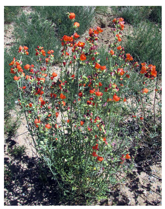
Figure 2. Small-leaf globemallow growing in Utah.

Small-leaf globemallow is a perennial with a large taproot and a branching, stout, woody caudex (Fig. 2) (Kearney 1935; Welsh et al. 1987). Plants produce several to many erect stems up to 3.3 feet (1 m) tall (Munz and Keck 1973; Holmgren et al. 2005; La Duke 2016). Stems are slender (≤ 5 mm in diameter at the base), unbranched or more commonly short-branched, and densely covered with stellate hairs, at least when young (Kearney 1935; Holmgren et al. 2005). Basal leaves are lacking; stems leaves are alternate (Munz and Keck 1973; Welsh et al. 1987; Holmgren et al. 2005). Larger leaves are 0.6 to 2.2 inches (1.5-5.5 cm) long and about as wide with 0.4 to 2-inch (1-5 cm) long petioles (Welsh et al. 1987). Leaf blades are thick and lack lobes or have 3 (sometimes 5) shallow, broad, rounded lobes (La Duke 2016; LBJWC 2018). Leaves are covered with a stellate pubescence (La Duke 2016), prominently 5-veined on the under sides, and have rounded and regularly toothed margins (Fig. 3) (Kearney 1935).