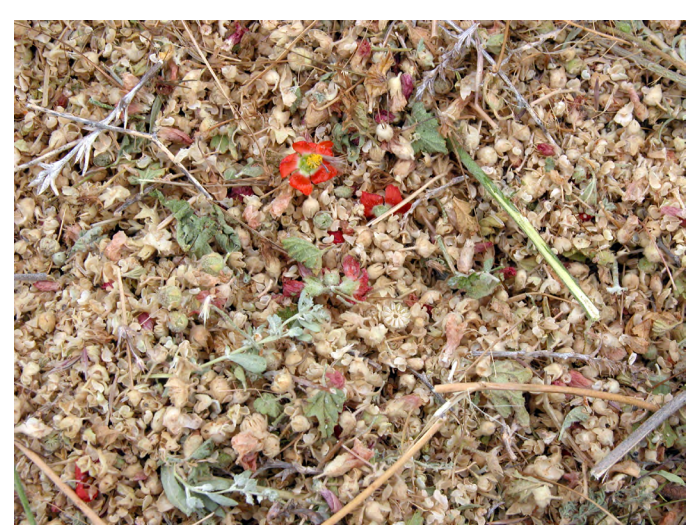
Figure 10. Mechanically harvested small-leaf globemallow seed from dense stands growing near the Utah-Arizona border.

Weather patterns in western Arizona may allow for spring and fall seed harvests (Comstock et al. 1988). When small-leaf globemallow was monitored at two Mojave Desert sites, plants flowered in both the spring and fall, which coincided with the bimodal rainy periods. Flowering peaked in April. Plants in this area experienced considerable dieback and were essentially dormant through the summer drought conditions. The winter during this one-year study period was also uncharacteristically warm and mild (Comstock et al. 1988).