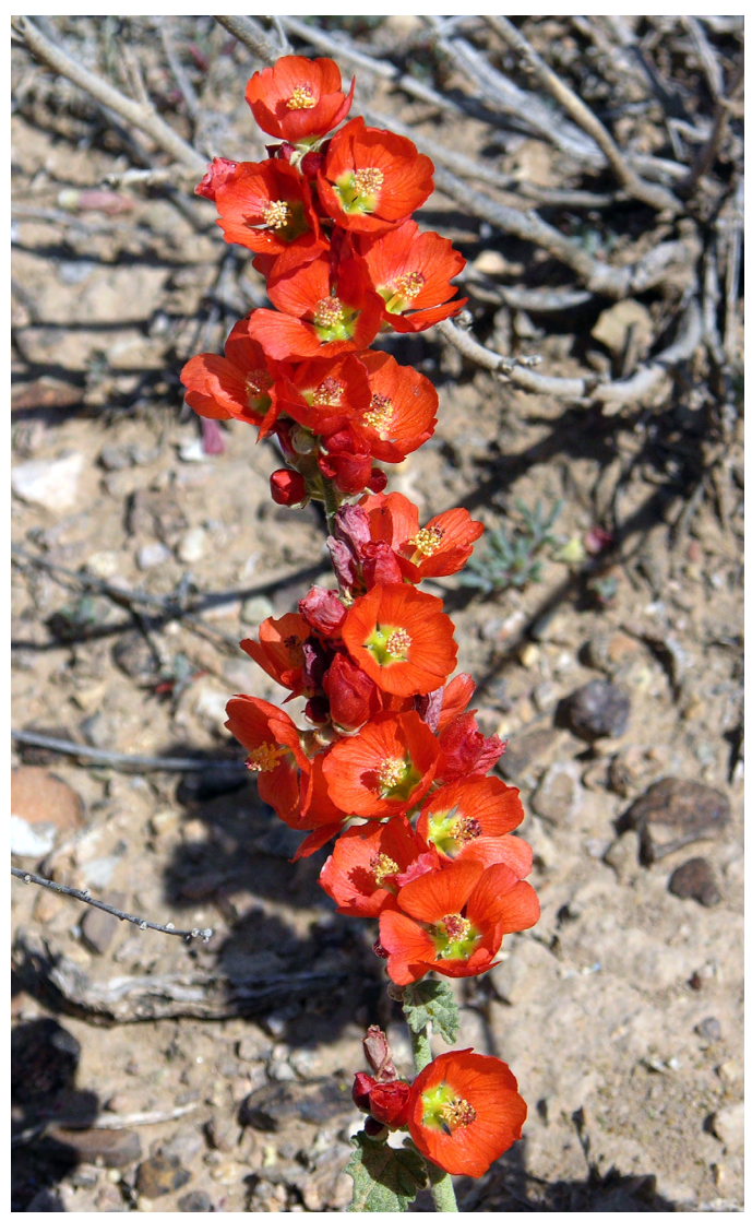
Figure 4. Small-leaf globemallow inflorescence on a plant growing in the Uintah Basin of Utah.