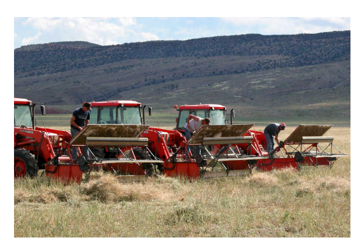
Figure 9. Strippers with hoppers used to mechanically harvest dense small-leaf globemallow stands growing near the Utah-Arizona border.