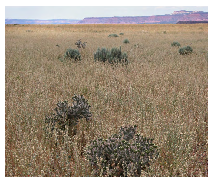
Figure 8. Dense wildland stand of small-leaf globemallow setting seed at the Vermillion Cliffs area near the Utah-Arizona border.

(1,398 m) elevation in Grand County, Utah (USDI BLM SOS 2017). The latest harvest date was August 11, 2010 from a site at 6,317 feet (1,925 m) elevation in Coconino County, Arizona. Of the 42 collections made over an elevation range from 4,196 to 7,262 feet (1,279-2,213 m), 37 were harvested in June or July. Thirty-five collections were from Utah and the others came from Nevada, Arizona, and Colorado (USDI BLM SOS 2017). In small-leaf globemallow stands established from transplants, flowering dates varied by site and plant age (Pendery and Rumbaugh 1990). First flowering was earlier at a northern Utah (early June) than at a southern Idaho site (late June). Average date of first flowering at both sites was 1.5 months earlier (June 1) for second year plants than it was for plants in their establishment year (July 15). Researchers also reported drier conditions in the second year (Pendery and Rumbaugh 1990).