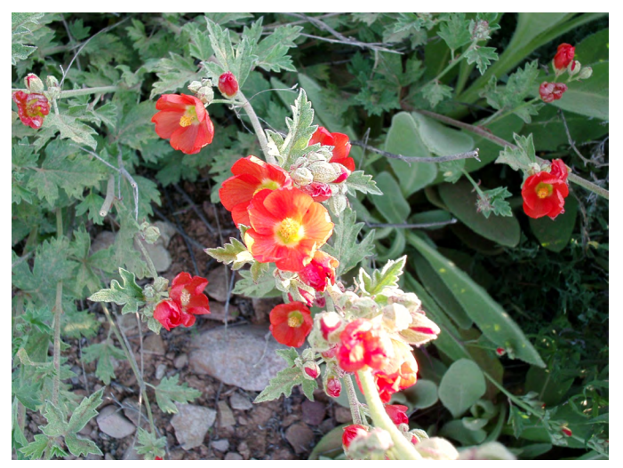
Figure 4. Munro's globernallow flowers on plant growing in Utah.

Flowers (often >25) are clustered in the leaf axils of leafy, narrow, spike-like inflorescences (Fig. 4) (Welsh et al. 1987; Rumbaugh and Pendery 1993; La Duke 2016; LBJWC 2018). Individual flowers are about 2 cm in diameter with five pale orange to brick red petals. Petals overlap at the base to form a bowl containing a column of numerous stamens, stamens, and the pistil (Taylor 1992; Holmgren et al. 2005; Pavek et al. 2011; La Duke 2016). Sepals are densely pubescent with star-shaped hairs and are retained through anthesis (Munz and Keck 1973; Welsh et al. 1987; Holmgren et al. 2005). Munro's globemallow produces rounded schizocarps, which are divided into 10 to 13 generally single-seeded or rarely two-seeded segments (mericarps) at maturity (Fig. 5; Taylor 1992). The mericarps are partially dehiscent and contain the seeds, which are brown, kidney-shaped, slightly hairy, and about 1.7 mm long (Fig. 6) (Welsh et al. 1987; Holmgren et al. 2005; La Duke 2016).