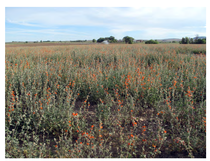
Figure 9. Munro's globernallow seed production field growing near Willow Creek, OR.

Researchers growing Munro's globemallow in Cache Valley, Utah, reported it was more easily grown in an agronomic environment than many other wildland forbs (Fig. 9) (Pendery and Rumbaugh 1986).