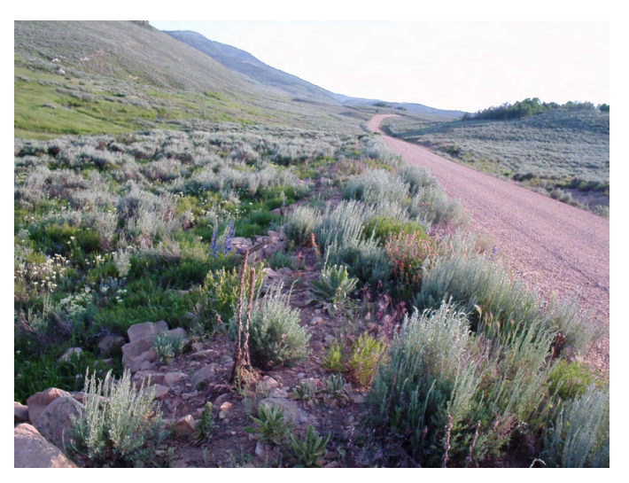
Figure 2. Munro's globernallow growing along the roadside in sagebrush habitat in Utah.

Leaves range from bright to dark green or graygreen with a dense covering of star-shaped hairs (Welsh et al. 1987; Taylor 1992). Plants do not produce basal leaves; stem leaves are arranged alternately (Holmgren et al. 2005; Pavek et al. 2011). Leaf blades are thin, egg-shaped to triangular, and distinctly but generally shallowly 3- to 5-lobed with round-toothed margins and stellate pubescent surfaces (Kearney 1935; Munz and Keck 1973; Pavek et al. 2011; La Duke 2016). Lobes generally extend half way to the midvein (Parkinson 2003). Leaves are about 0.4 to 2 inches (1-6 cm) long and wide with 0.8 to 1.5-inch (2-4 cm) long petioles (Munz and Keck 1973; Welsh et al. 1987). Leaves are palmately 5-veined from the base, but veins are not prominent on the undersides of leaves (Kearney 1935; Holmgren et al. 2005).