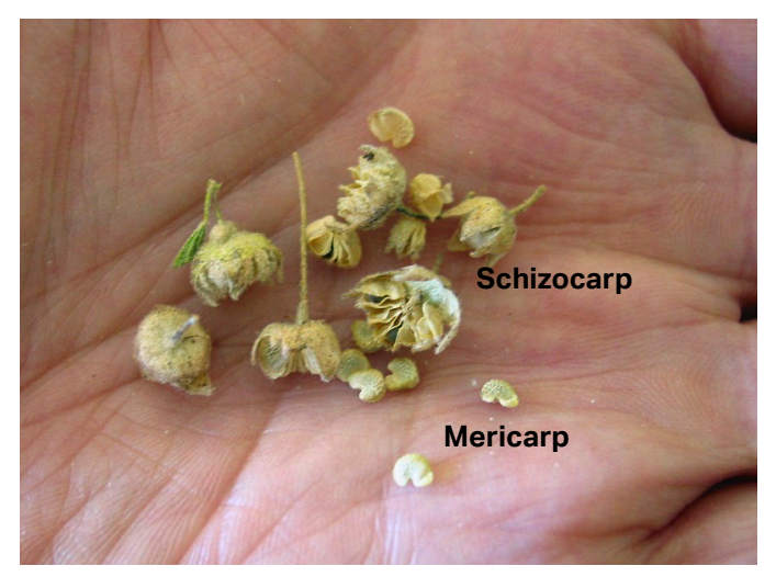
Figure 5. Munro's globernallow schizocarps and what are generally single-seeded mericarps collected from plants in Idaho.