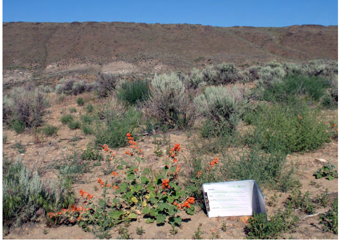
Figure 1. Munro's globemallow growing in sagebrush habitat in Oregon.

Habitat and Plant Associations. Munro's globemallow is commonly found on xeric plains and slopes receiving 6 to 14 inches (152-356 mm) of annual precipitation (Ogle et al. 2012; La Duke 2016). It is often found growing in mixed desert shrub, sagebrush ( Artemisia spp.), saltbush ( Atriplex spp.), rabbitbrush ( Chrysothamnus spp.), juniper ( Juniperus spp.), and mountain brush communities (Fig. 1, 2) Welsh et al. 1987; Rumbaugh and Pendery 1993; Holmgren et al. 2005).