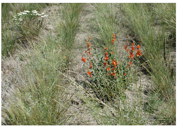
Figure 10. Munro's globernallow growing in a post-fire restoration seeding in Elmore County, Idaho.

In a post-fire restoration study, Ott et al. (Ott et al. 2015) found that Munro's globernallow density increased as time since seeding increased even when a second fire burned restoration plots (Fig. 10). Seed collected from Uintah County, Utah, at 5,085 feet (1,550 m) was seeded the fall or winter following a June 2010 fire in Wyoming big sagebrush in Elmore County, Idaho, at 3,940 feet (1,200 m). Munro's globernallow was part of a mixture seeded at a rate of 3.6 PLS/ft<sup>2</sup> (40/m<sup>2</sup>). Density of Munro's globemallow in the seeded area was 282 plants/acre (705/ha) in 2011 and 624 plants/acre (1,560/ha) in 2013. Because a portion of the restoration area burned again in July 2012, burned and unburned areas were monitored separately in 2013. There were 1,305 Munro's globernallow plants in burned and 279 plants in unburned areas (Ott et al. 2015).