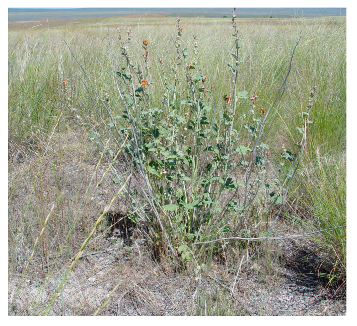
Figure 7. Second year Munro's globernallow seeded on a burned site in northern Utah.

Munro's globemallow has many traits and characteristics that make it a desirable species for revegetation (Fig. 7). It tolerates disturbances and harsh environments, occurs on exposed or eroded sites, and is important to pollinators. It is utilized by wildlife and livestock, providing green forage early in the spring and after summer and fall precipitation (Gautier and Everett 1979; Ogle et al. 2012; Eldredge et al. 2013). It may also be a good candidate for soil stabilization (Kildisheva et al. 2011).