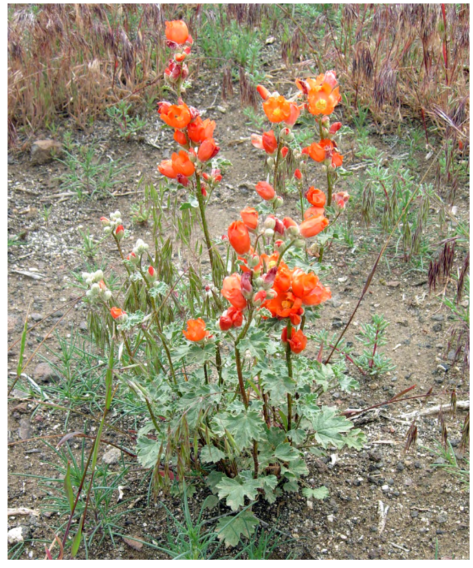
Figure 3. Munro's globemallow growing in Idaho.

Flowers (often >25) are clustered in the leaf axils of leafy, narrow, spike-like inflorescences (Fig. 4) (Welsh et al. 1987; Rumbaugh and Pendery 1993; La Duke 2016; LBJWC 2018). Individual flowers are about 2 cm in diameter with five pale orange to brick red petals. Petals overlap at the base to form a bowl containing a column of numerous stamens, stamens, and the pistil (Taylor 1992; Holmgren et al. 2005; Pavek et al. 2011; La Duke 2016). Sepals are densely pubescent with star-shaped hairs and are retained through anthesis (Munz and Keck 1973; Welsh et al. 1987; Holmgren et al. 2005). Munro's globemallow produces rounded schizocarps, which are divided into 10 to 13 generally single-seeded or rarely two-seeded segments (mericarps) at maturity (Fig. 5; Taylor 1992). The mericarps are partially dehiscent and contain the seeds, which are brown, kidney-shaped, slightly hairy, and about 1.7 mm long (Fig. 6) (Welsh et al. 1987; Holmgren et al. 2005; La Duke 2016).