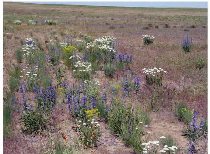
Figure 11. Royal penstemon in a post-fire study plot in southern Idaho.

Because of the low competitive ability of royal penstemon with cheatgrass (Parkinson 2008, Parkinson et al. 2013), it should be seeded in areas where cheatgrass seed density has been reduced by wildfire or other treatments and is not expected to recover rapidly (Ott et al. 2016b). To avoid competition with more rapidly growing seeded grasses and forbs having similar root morphologies, royal penstemon should be seeded in separate rows or areas, either alone or with other slow growing species with different rooting habits (Fig. 11; Parkinson 2008). This would reduce spatial overlap and interspecific competition for resources while increasing the diversity of species and life forms. Cane et al. (2007) suggested that royal penstemon pollinators Osmia brevis and O. penstemonis may have shallow underground nests, in which case they and the surface nesting Pseudomasaris vespoides would be susceptible to soil heating by wildfires (Cane and Neff 2011) or soil disturbance resulting from mechanical site preparation practices. Loss of specialist pollinators would restrict seeding of royal penstemon to areas near native vegetation that are likely to harbor the pollinators (Cane and Love 2016).