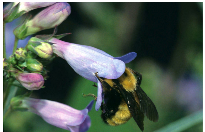
Figure 10. Royal penstemon flower pollinated by a bumblebee ( Bombus spp.).

Irrigation. Subsurface drip Irrigation requirements for royal penstemon were examined at OSU MES using subsurface drip irrigation (Shock et al. 2015b). This system provides precise application of water directly to the root system and away from crown tissues. This minimizes water use and reduces water availability to weed seeds. Drip lines were placed 12 inches (30 cm) deep between alternate rows (30-inch [76-cm] row spacing). Zero, 4, or 8 inches (0, 100, 200 mm) of supplemental water was added in four equal applications at 2-week intervals beginning with flowering. From 2006 to 2015, irrigation began between April 19 and May 20 ( \bar{x} = May 5) and ended between June 3 and June 5 ( \bar{x} = June 18). Seed yield of royal penstemon demonstrated a quadratic response to irrigation with the maximum response with 5 inches (130 mm) of irrigation. Irrigation of 4 to 8 inches (100–200 mm) supplemental water was recommended for warm, dry years, and none for cool, wet years (Shock et al. 2016).