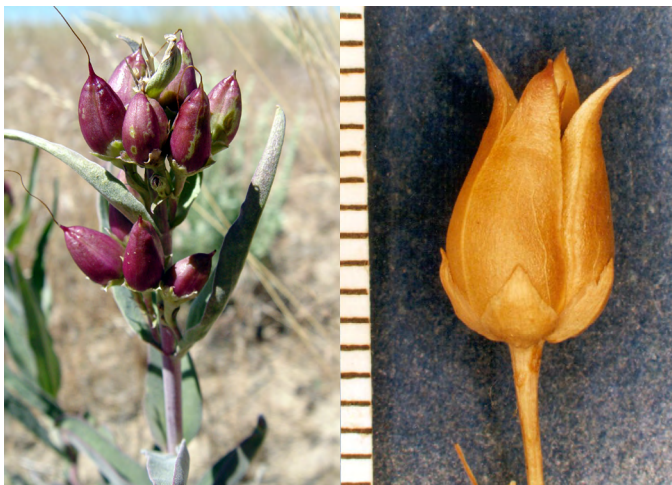
Figure 2. Royal penstemon with immature capsules (left) and mature capsule (right; scale in mm).

Castellanos et al. (2002) found the time from flower opening to fruit dehiscence averaged about 4.2 days in a royal penstemon population at 6,600 feet (2,000 m) in the southern Sierra Nevada Mountains of California. They described six stages of floral phenology: flower opening to (1) anterior anther dehiscence (0.2 day), (2) posterior anther dehiscence (0.4 day), (3) style tip bent <45^\circ (1.3 days), (4) style bent >45^\circ (1.6 days), (5) style bent 90^\circ (1.9 days), and (6) corolla abscised (4.2 days). Style bending was assumed to indicate stigma receptivity as it positions the stigma to receive pollen carried by foraging bees or wasps after pollen from the same flower has been released, thus encouraging cross pollination (Chari and Wilson 2001). Nectar secretion began with corolla opening, slowing unless visited by a pollinator.