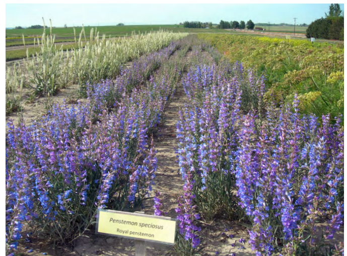
Figure 8. Royal penstemon irrigation test plots at OSU MES, Ontario, Oregon.

In 2013 establishment was improved ( P < 0.05 ) relative to the control (0.1% stand) only by combinations that included row cover and seed treatment. The addition of sawdust or sand did not result in further significant increases. The range for these treatments was 27 to 33.1% (Shock et al. 2014). In April 2014, only the combination of row cover, seed treatment, sawdust and sand (12.2% stand) improved stand compared to the control (0.7% stand) ( P < 0.05 ) for plots planted in fall 2013 (Shock et al. 2015a).