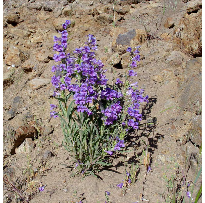
Figure 1. Royal penstemon plant in southeastern Oregon.

leaves are reduced upward, linear to lanceolate, subcordate, clasping, and folded lengthwise or flat (Cronquist et al. 1984; Hickman 1993). Leaves and stems may be purplish tinted. The inflorescence is an elongate, one-sided thyrse, an inflorescence with an indeterminate main axis and determinate subaxes (Fig. 1). There are sometimes thyrsoid branches from the lower nodes (Cronquist et al. 1984; Hickman 1993). Flowers are produced in 4 to 12 closely-spaced verticillasters (false whorls) along the inflorescence (Strickler 1997).