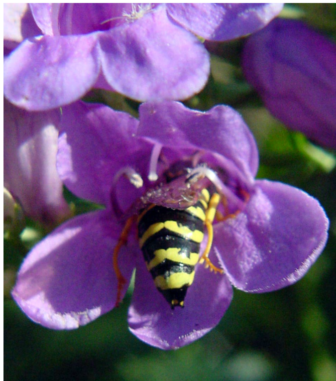
Figure 5. Royal penstemon visited by a solitary pollen wasp.

Pollination. Cane and Love (2016) inventoried pollinator abundance and diversity at native forbs used in restoration to estimate their “pollinator friendliness.” Surveys were conducted at four Nevada sites in sagebrush steppe and its ecotones with pinyon-juniper woodlands. Solitary native bees of the genus Osmia (Mason bees) comprised half of the observed pollinators at royal penstemon (Cane and Love 2016), while the solitary pollen wasp ( Pseudomasaris vespoides ), which may sleep in the flowers at night (Nold 1999), accounted for 19.8% of the observed pollinators (Fig. 5). The remaining pollinators included the bee genera Anthophora (digger bees, 2.7%), Bombus (bumblebees, 8.1%), Ceratina (small carpenter bees, 0.9%), Halictus (sweat bees, 11.7%), Hoplitis (Mason bees, 1.8%) and Lasioglossum (sweat bees, 3.6%). Two Mason bees ( Osmia brevis and O. penstemonis ) and the solitary pollen wasp were pollen specialists