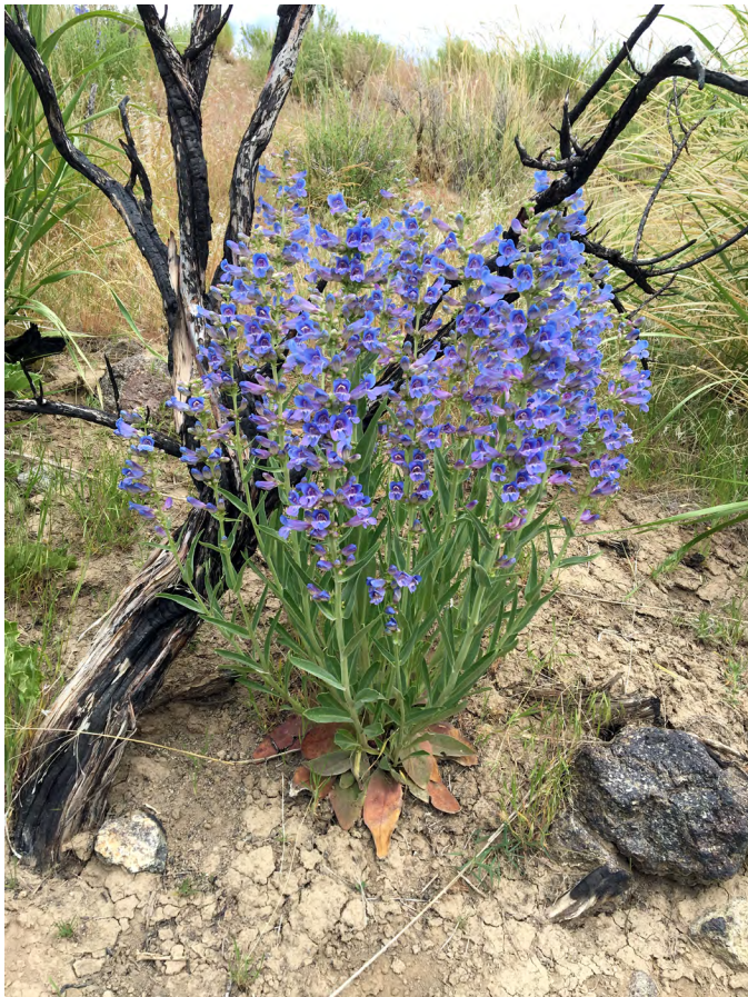
Figure 6. Royal penstemon one year after wildfire.

experienced under a snow pack followed by 4 weeks of incubation at 50 to 68 °F (10-20 °C) in light increased germination to 70%. Germination increased to 90% with 24 weeks of prechilling (Meyer and Kitchen 1994).