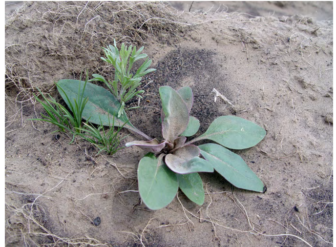
Figure 12. Royal penstemon seedling emerging from a post-fire seeding in southern Idaho.

be planted in spots prepared to limit competition. Initial watering may be required for planted seedlings if the soil is dry.