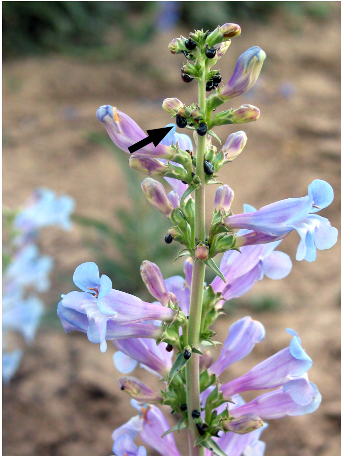
Figure 9. Royal penstemon “tears” (arrow). These are black tar-like drops produced near flower buds following lygus bug predation.

peak flowering for royal penstemon. Prolonged infestation and low seed set resulted from an early hatch in 2007 that was not adequately controlled by the insecticide treatment (Aza-Direct® [ai.: azadirachtin] at 0.0062 lb ai./ha, applied in May). Capture at 0.1 lb/acre and Orthene at 8 oz/acre (a contact and residual systemic) were applied during flowering or pre-flowering in subsequent years to control lygus bugs (Shock et al. 2016).