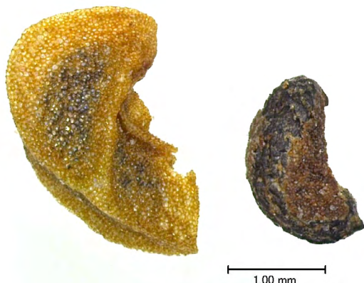
Figure 3. Royal penstemon seeds.