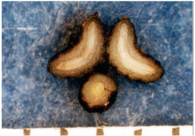
Figure 4. Royal penstemon seed: cross section and longitudinal sections. The embryo is surrounded by endosperm and the seed coat. Scale in mm.

The fruit is a capsule, 0.2 to 0.6 inch (0.6-1.5 cm) long that opens apically. It becomes dry and parchment colored at maturity (Fig. 2). Seeds are brown, 2 to 2.5 (3.5) mm long, somewhat elongate and three-angled (Fig. 3; Cronquist et al. 1984; Hickman 1993; Hurd n.d.). The embryo is slightly curved and embedded in living endosperm (Fig. 4; Hurd n.d.). Seeds are gravity dispersed.