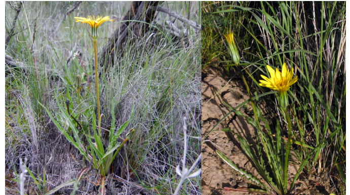
Figure 1. Sagebrush false dandelion plants in flower.

inches (5 to 15 cm) long and less than 0.4 inches (1 cm) wide (Cronquist 1955; Munz and Keck 1973; Taylor 1992). Leaf surfaces are glabrous or villous, and the margins are often wavy and ciliolate (Cronquist 1955; Chambers 2006).