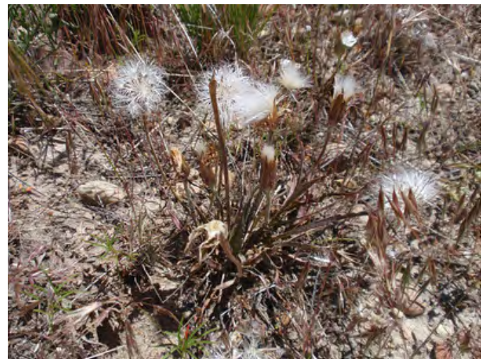
Figure 4. Sagebrush false dandelion plants with mature and dispersing seedheads illustrating uneven ripening.

Wildland seed certification. Wildland seed collected for direct sale or for establishment of agricultural seed production fields should be Source Identified through the Association of Official Seed Certifying Agencies (AOSCA) Pre-Variety Germplasm Program that verifies and tracks seed origin (Young et al. 2003; UCIA 2015). For seed that will be sold directly, collectors must apply for certification prior to making collections. Applications and site inspections are handled by the state where collections will be made. For seed that will be used for agricultural seed fields, nursery propagation or research, the same procedure must be followed. Seed collected by some public and private agencies