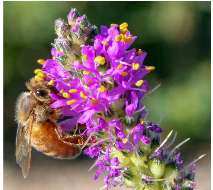
Figure 3. Honey bee ( Apis spp.) visiting Searls' prairie clover flowers.

Searls' prairie clover is recommended for diversification of revegetation or restoration seed mixes for sites within its range receiving annual precipitation of 6 to 14 inches (152-356 mm) (St. John et al. 2011). It is also recommended for enhancing pollinator habitat (Fig. 3). In a guide to pollinator plantings for the Intermountain West, prairie clovers ( Dalea spp.) were described as important to bees and exhibiting a moderate growth rate (Ogle et al. 2011). As a legume that contributes to atmospheric nitrogen fixation, the presence of Searls' prairie clover can increase a site's nutrient availability, improve forage quality, and occupy niches otherwise colonized by weed species (Review in Johnson et al. 2015).