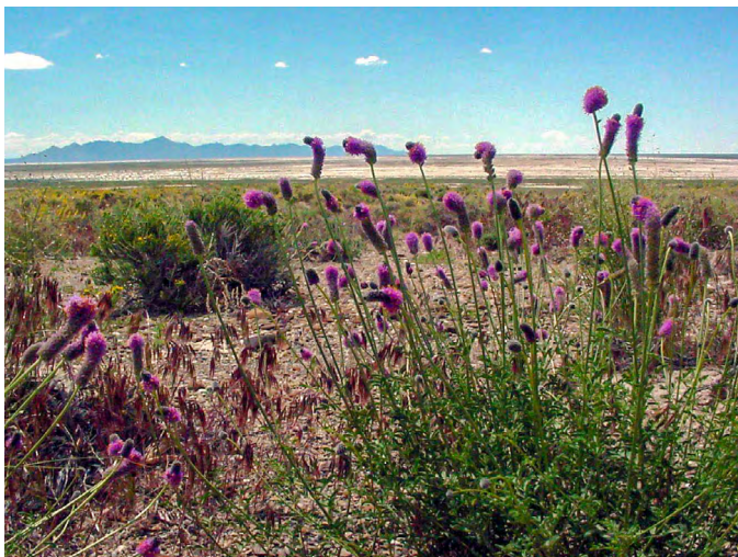
Figure 1. Searls' prairie clover growing in the Great Salt Lake Desert, Nevada.

Soils. Searls' prairie clover is commonly associated with lime-rich soils, but it also occurs on sandstone and other bedrock substrates (Barneby 1977). Sandy or gravelly substrates in areas receiving 6 to 14 inches (152-356 mm) of annual precipitation are common habitats (St. John et al. 2011).