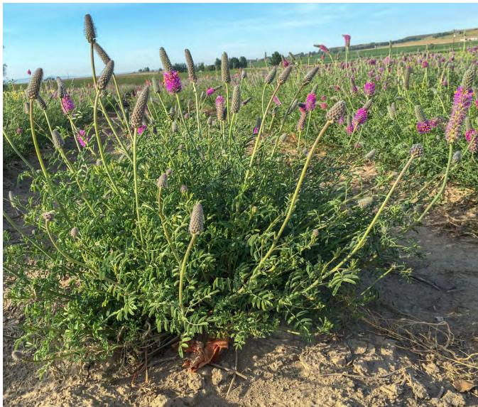
Figure 4. Searls' prairie clover growing in seed production plots at Oregon State University's Malheur Experiment Station in Ontario, Oregon.

The Western Wildland Environmental Threat Assessment Center's (USFS WWETAC 2017) Threat and Resource Mapping (TRM) Seed Zone application provides links to interactive mapping features useful for seed collection and deployment planning. The Seedlot Selection Tool (Howe et al. 2017) can also guide restoration planning, seed collection, and seed deployment, particularly when addressing climate change considerations.