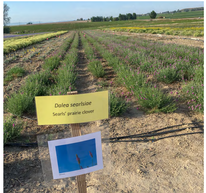
Figure 6. Searls' prairie clover seed production plots growing at the Oregon State University, Malheur Experiment Station in Ontario, Oregon.

Site Preparation. Researchers at IPMC recommend seeding Searls' prairie clover 0.25 to 0.5 inch (0.6-1.3 cm) deep into a firm weed-free bed (St. John et al. 2011). At OSU MES, seed production plots were grown in silt loam soils with a pH of 8.3 and 1.1% organic matter (Fig. 6). Seeding into weed-free plots was done in the fall. Seed was deposited on the soil surface using a custom small-plot grain drill with disk openers. Seed was subsequently covered with sawdust at rate of 7 g/foot (24 g/m) of row and then by row cover, which was removed in April (Shock et al. 2018). In direct surface seeding trials at OSU MES, stand emergence for Searls' prairie clover was low (0.1-3% stand) but better with row cover than without regardless of other seed coverings (none, sand, or sawdust) (Shock et al. 2017a).