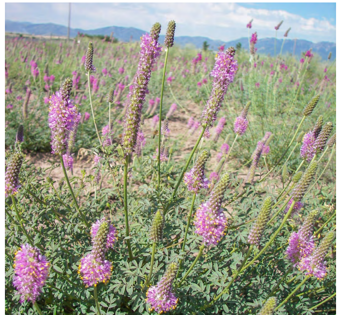
Figure 2. Searls' prairie clover plants growing in research plots in northern Utah.

Flowers are tiny and perfect with five pink to purple petals (Cane et al. 2012; Johnson et al. 2015). They are clustered on moderately dense, cylindrical spikes (0.6-5 inches [1.6-13 cm] long and 8-12 mm wide) (Barneby 1989; K. Connors, USDA-ARS, personal communication, January 2019). Calyces are 10-ribbed and mostly glabrous except for the lobes, which have long hairs. Flowers have five stamens. The style is 4 to 5 mm long (Welsh et al. 2016). Although the small, hairy fruits (pods) contain two ovules, just one seed matures (St. John et al. 2011; Johnson et al. 2015). Seeds are villous (Welsh et al. 2016).