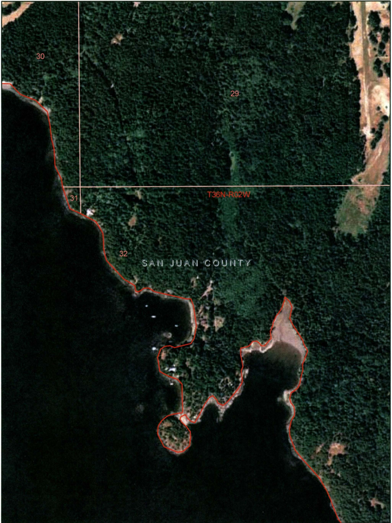
13-29, Park Bay Island, N 48 33' 58.19", W 122 59' 4.798"