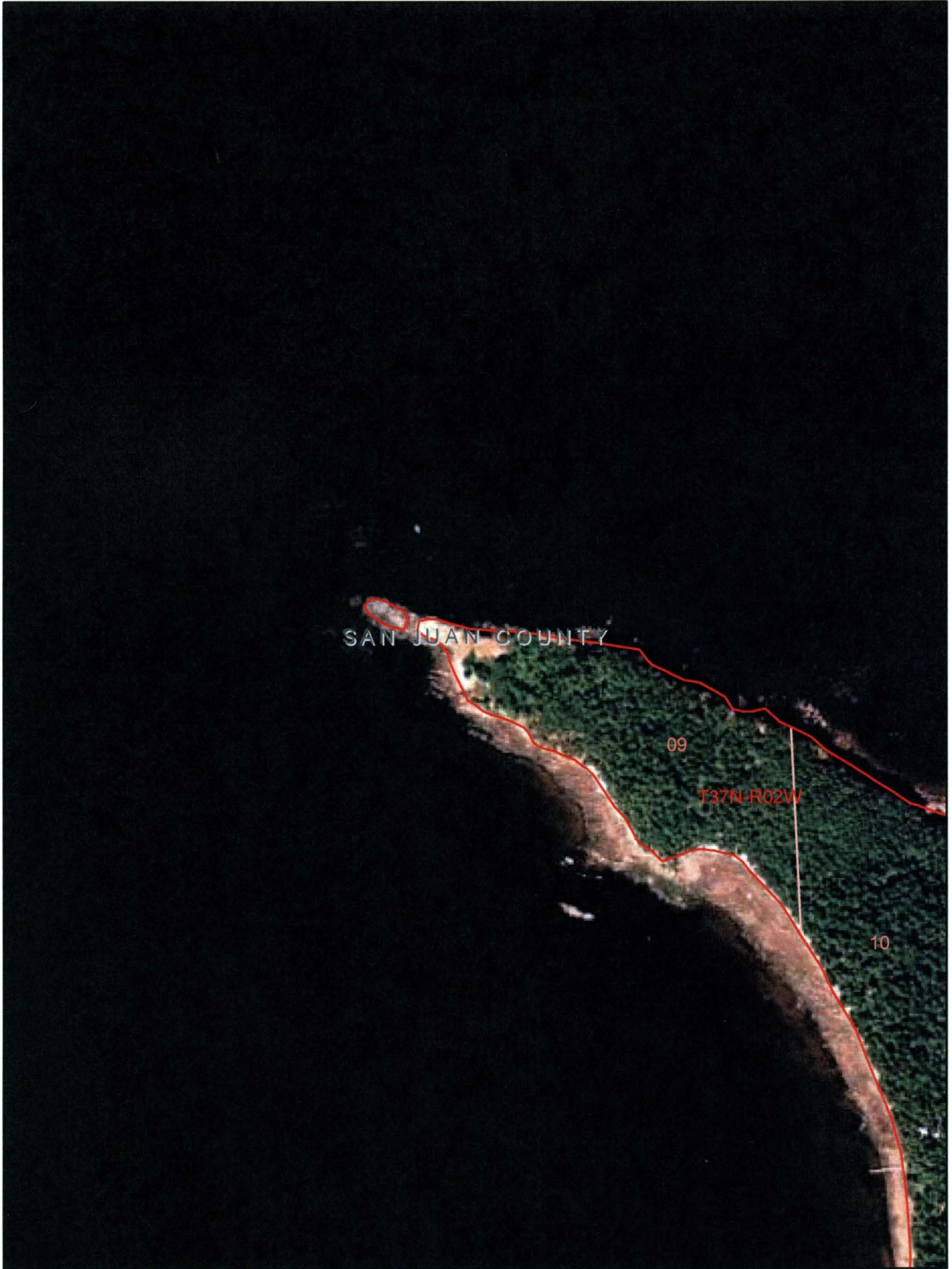
13-71, Point Doughty, T37N, R02W, Section 09, N 48 42' 43.45", W 122 57' 2.656"