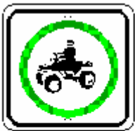
FR 17-1 18" X 18" (w/green circle)

SEASONAL CLOSURE (with dates): This sign will first show the modes of travel that are allowed on the road under the words “Open To”. Below these, the modes of travel that are restricted will be shown with red-slashed symbols under the words “Seasonal Closure”. The dates of the restricted travel will be shown below the symbols.