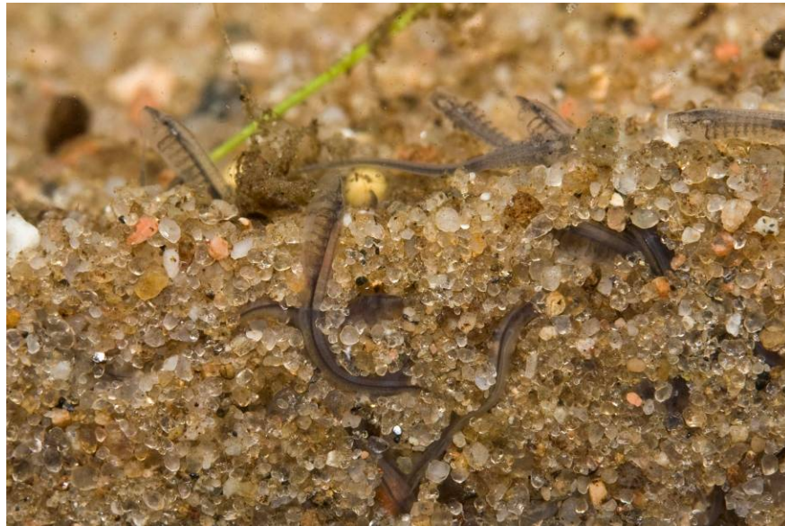
a. (European brook lamprey)