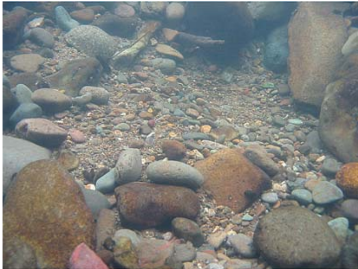
a. (photo courtesy of U.S. Fish and Wildlife Service, Christina Luzier)