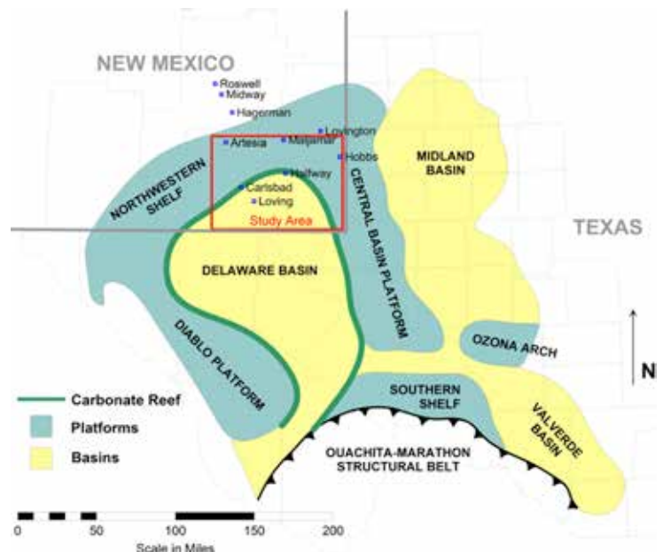
Study area in southwest New Mexico.

Advancements in directional drilling and well completion technologies have resulted in exponential growth in the use of hydraulic fracturing for oil and gas extraction. Within the Bone Spring Formation of the New Mexico Permian Basin, water demand to complete each hydraulically fractured well is estimated to average 7.3 acre-feet