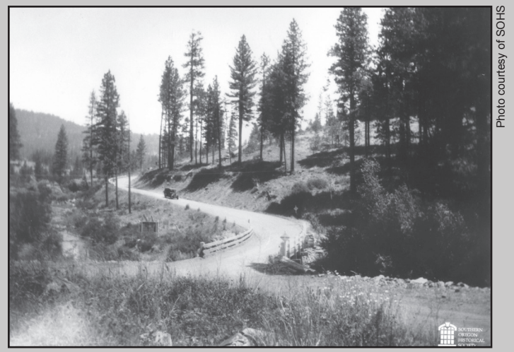
State Highway 66 at Keene Creek Reservoir circa 1929

While exploring the Cascade-Siskiyou National Monument, please remember: