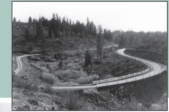
State Highway 66 at Keene Creek Reservoir circa 1929

Approximately 53,000 acres of public land in the vicinity of the Greensprings are managed as the Cascade-Siskiyou National Monument in recognition of the area's outstanding natural diversity. The Monument lies at the convergence of the Cascade and Siskiyou mountain ranges. The collision of these mountain ranges, containing some of the youngest and oldest rocks in Oregon, has resulted in a great variety of plant and animal species. Many visitors to the Monument will access the area by first traveling through the Greensprings community along Highway 66.