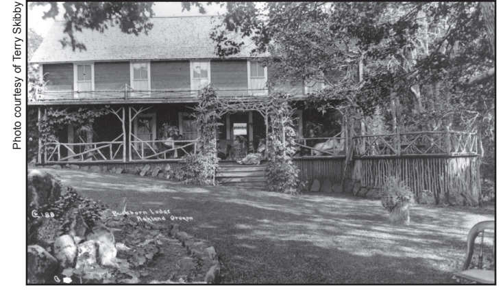
Buckhorn Springs circa 1910

Steeped in history, sights along Highway 66 offer a glimpse of the past. Many businesses on the Greensprings carry on the tradition of offering services to contemporary travelers.