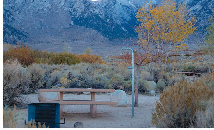
Tent site at Tuttle Creek Campground near sunset