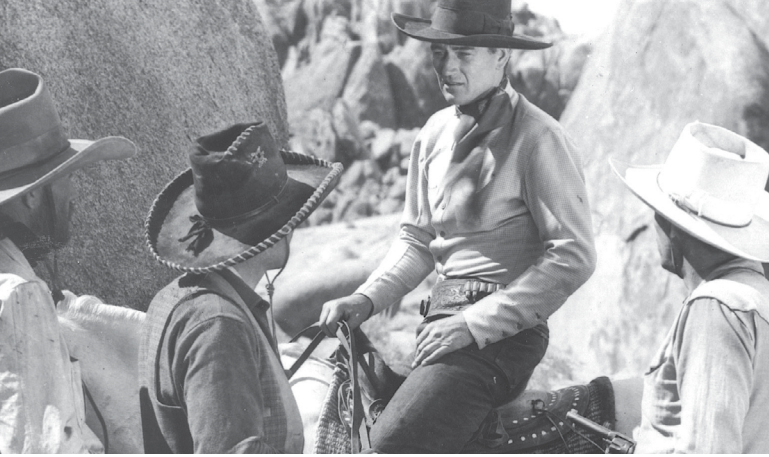
Photo from The Lawless Range